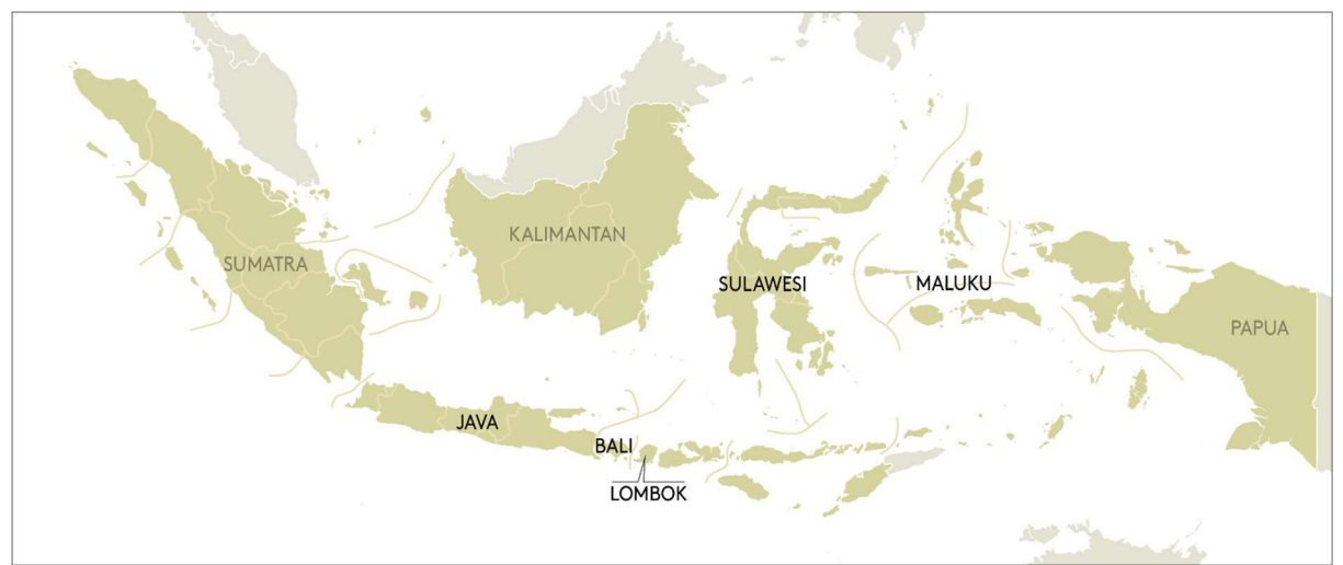
Figure 1: Locations of the initiatives examined in the research.

The study focuses on examining four types of initiatives across Java, Bali, Sulawesi, Lombok, and the Moluccas (Figure 1). The selection of seven initiatives was based on the following criteria: a) all initiatives operate voluntarily; b) are partly or fully funded by external sources, including private or private sector investments, donors, or grants; and c) intend to actively transfer technology as well as "know-how" from developed economies to regions lacking waste management and infrastructure. For some initiatives, partial financial revenues may come from households, sales of recyclables, and local authorities.