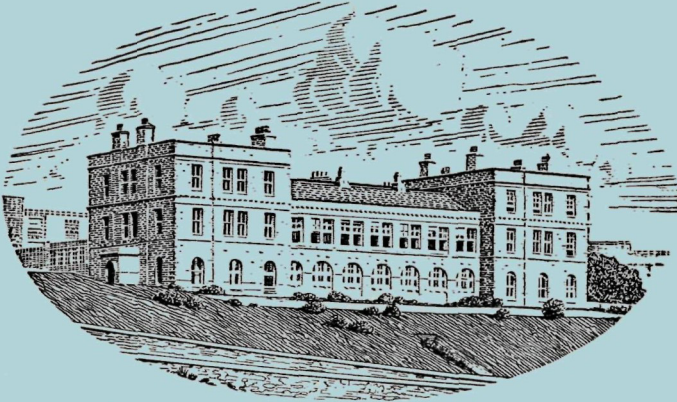
THE PLYMOUTH LABORATORY