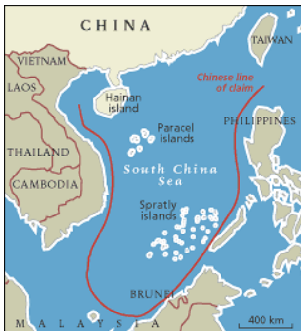
Chinese claims in Spratley Islands area

In the Spratlys, the armed garrisons that all the claimants (except Brunei) have stationed on the tiny dots of land they say are theirs are still in place and, in some cases, have been reinforced. A code of conduct for the South China Sea, signed by Beijing and ASEAN (the Association of South East Asian Nations) in 2002, is voluntary. A joint seismic survey of hydrocarbon resources, agreed in 2005 by the national oil companies of China, Vietnam, and the Philippines, lapsed last July and may not be renewed. Even when it was operational, the tripartite seismic survey did not include the other three Spratly Island claimants. Moreover, it covered only a small part of the contested sea area.