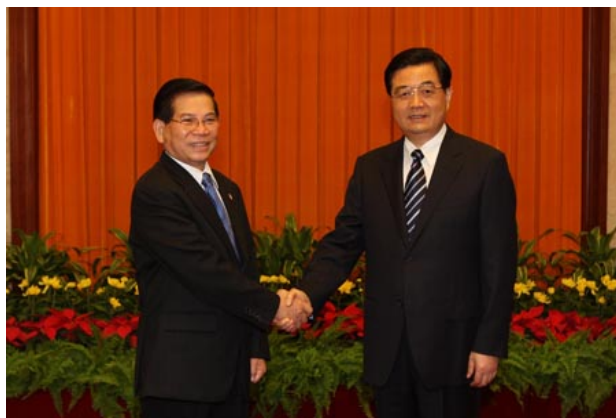
Vietnamese President Nguyen Minh Triet (L) and

China and Vietnam have outlined new steps to resolve their long-running territorial disputes in the South China Sea in an effort to avert further conflict and put their relations on a steadier footing for the future. Although both countries are ruled by Communist parties and share extensive land and sea borders, they have had a tense relationship. But they now face political challenges at home as their export-oriented economies and investment slow under the impact of global financial turmoil and deepening recession. They have evidently decided to give primacy to strengthening bilateral party, trade and investment ties to offset the wider economic downturn.