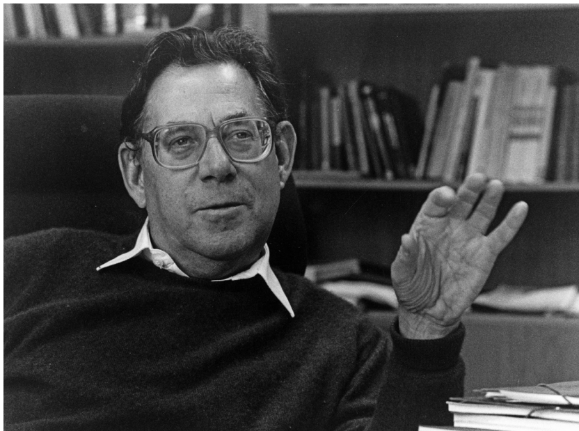
FIGURE 3.1 Netherlands-born Paul Crutzen, Nobel Laureate in Chemistry in 1995 for his work on the ozone hole, was essential in the formation of Stockholm into a global hub of environmental and climate science. He was employed by Stockholm University as a computer programmer in 1959 and wrote foundational papers from the year 2000 proposing the Anthropocene as a new geological epoch.