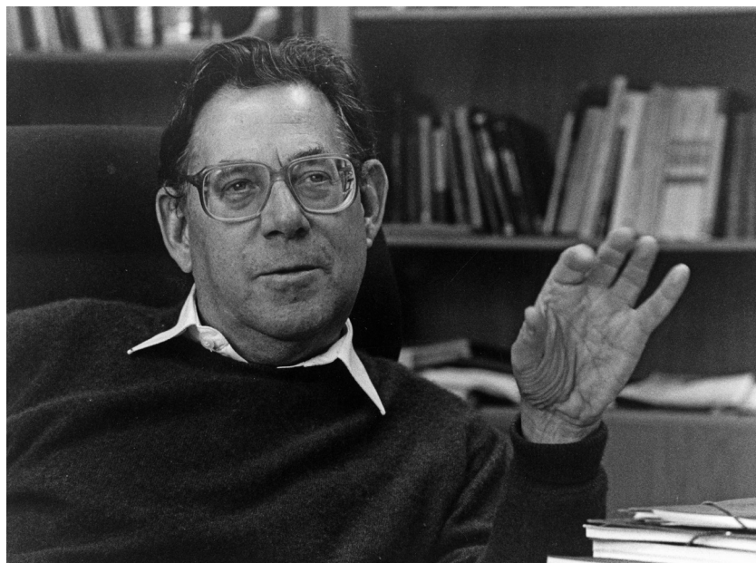
FIGURE 3.1 Netherlands-born Paul Crutzen, Nobel Laureate in Chemistry in 1995 for his work on the ozone hole, was essential in the formation of Stockholm into a global hub of environmental and climate science. He was employed by Stockholm University as a computer programmer in 1959 and wrote foundational papers from the year 2000 proposing the Anthropocene as a new geological epoch.

1961–1962, working together with Bolin. The late 1950s also included the incidental hiring of a certain Dutch civil engineer specializing in bridge construction, Paul Crutzen (Figure 3.1), who had been living in the central Swedish city of Gävle with his Finnish wife. Answering a newspaper ad for a computer programmer, Crutzen would become employed by the Meteorological Institute, where he also took courses and subsequently began his PhD training with Bert Bolin as his supervisor. During his time at Stockholm University, Crutzen would also contribute important early articles on stratospheric ozone depletion to Ambio , a journal based at the Royal Swedish Academy of Sciences for which he also served on the editorial board. 18 After graduating in 1973, Crutzen fairly rapidly became recognized as a world-leading atmospheric scientist. He was