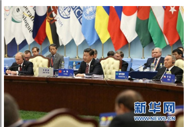
CICA 2014 plenary with Vladimir Putin (left) and Xi Jinping (center).

What President Park probably most wanted to hear from Xi was a strong commitment to pressing North Korea on nuclear weapons and ballistic missiles as a condition of resumption of diplomatic engagement. As is by now well known, discussion in Beijing has turned from consistent support of Pyongyang on the nuclear issue to concern about how Pyongyang's behavior might hurt PRC interests. But China's public position had already been established when Xi Jinping spoke in May to the 24-member Conference on Interaction and Confidence Building in Asia (CICA), a four year old Chinese diplomatic initiative. 9 That group embraces most Asian as well as Middle East countries.