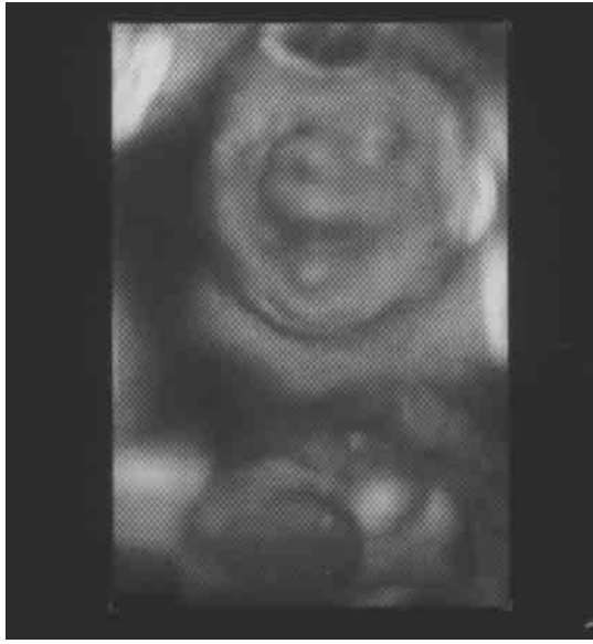
Figure 2 Three-dimensional sonography showing a ventral wall defect with the heart outside the thorax.

(Baker et al., 1984). Normal development of the fetal abdomen depends on the migration of the lateral folds and correct ventral mesodermal differentiation (Bonilla-Musoles et al., 2001). The flat embryo becomes tubular during the fourth week as the result of the circumferential enfolding of the cephalic, caudal, and two lateral abdominal wall folds. If the lateral ectodermal and mesodermal folds fail to fuse along midline, by the end of 4 weeks, an abdominal wall defect develops (Baker et al., 1984). Intracardiac lesions result from faulty mesodermal development. Cantrell's pentalogy results from failure of the cephalic fold to close (Seeds et al., 1984).