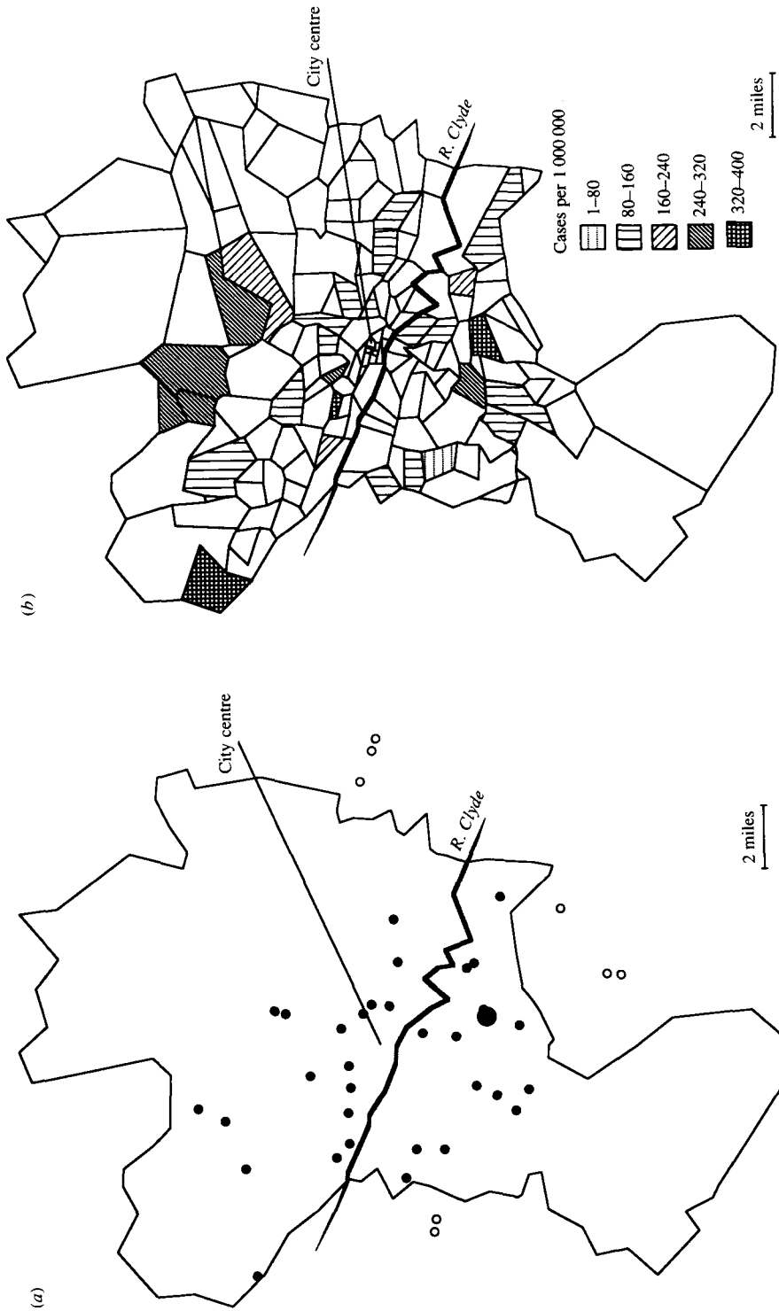
Fig. 3. (a) Travel-related Legionnaires' disease in GGHB and surroundings 1978-86. (b) Travel-related Legionnaires' disease in GGHB 1978-86, rates per million by postcode sector.