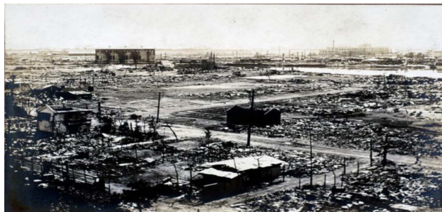
Figure 1: Yokohama after the Earthquake and Fires (Yokohama Central Library, 1923).

Ikeuchi's volume was just one of the many in-depth analyses of the economic consequences of the disaster produced by Japanese officials, businessmen, academics and economic journalists in the months and years that followed. These analyses continued to appear into the early 1930s. The country then found itself facing two major man-made disasters of arguably even greater proportions: the Great Depression that followed the Wall Street Crash of 1929 and the Second Sino-Japanese and Pacific Wars. For many Japanese, the economic hardships of 1923 paled into insignificance compared to the economic damage wrought by these new events, and as memories of the earthquake itself receded, replaced by new economic challenges, so too did the widespread and frequent publication of reports and analyses of the economic effects of the disaster.