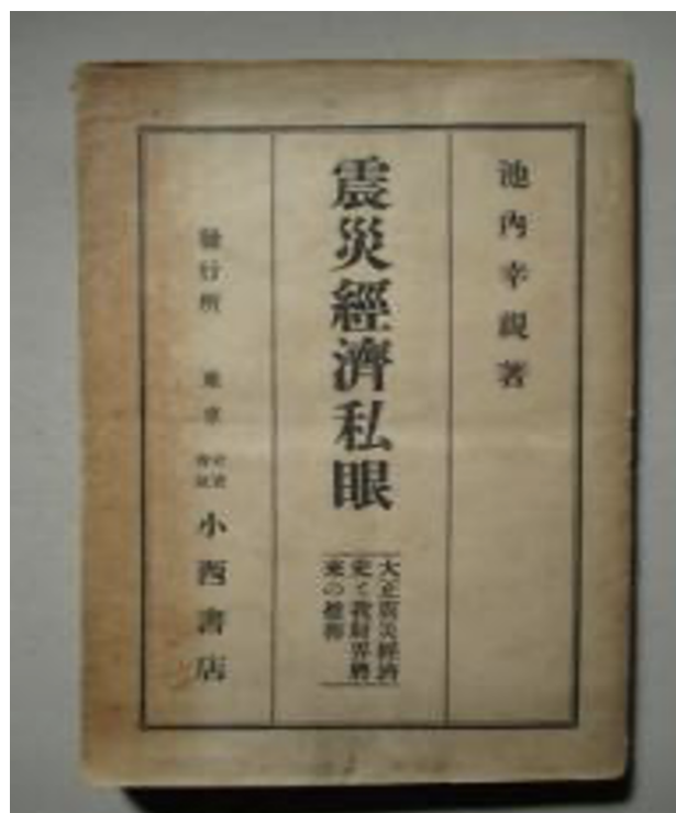
Figure 3: Front cover of Ikeuchi Yukichika's Shinsai Keizai Shigan .

For survivors in 1923, the clear priority was rebuilding livelihoods; they continued to follow Adam Smith's mantra of 'truck, barter and exchange', and made economic decisions in line with this imperative. The extensive commentary on the disaster's effects on the economy was integral to this process as politicians, economists, businessmen, and journalists sought to analyze the economic responses of people and markets with a view to facilitating recovery. The focus on market activity in this commentary was explicit. Japan in 1923 was overwhelmingly a market economy. Economic intervention by the government invariably sought to manipulate the market, and not to substitute for it. It followed that markets and market activity would also frame the economic impact of a disaster, an assumption doubtless born of Japan's shared and long experience of frequent natural disasters and the responses that they could provoke. The clarity with which this focus on markets was articulated may also, in the case of some commentators, have been sharpened by a high level of advanced economics training, either in Japan or overseas. Nowhere is this focus more clearly articulated than in Ikeuchi's Shinsai Keizai Shigan .