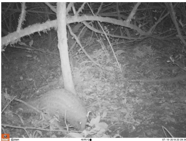
PLATE 1 Giant pangolin Smutsia gigantea photo-trapped in an Afromontane forest in western Kenya, on 19 July 2018 at 22.28.

a camera-trap survey conducted in July 2018 in a primary highland forest in Kenya's Rift Valley region, in which a giant pangolin was captured in a single event (Plate 1). The presence of the giant pangolin in this location potentially makes it sympatric with Temminck's pangolin, a species with which the giant pangolin can be confused because of their morphological similarities (Hoffmann et al., 2020). Although the area where the image was captured is within the defined range of Temminck's pangolin (Pietersen et al., 2019), to our knowledge there are no confirmed records of Temminck's pangolin from this area nor from rainforest habitats anywhere across its range. Confirmation of this record being a giant pangolin is based upon the habitat type and several physical characteristics: Temminck's pangolin is considerably smaller than the giant pangolin (up to 140 cm in total length and weighs up to 21 kg; Pietersen et al., 2019), and a blue duiker Philantomba monticola