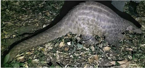
PLATE 2 Giant pangolin photographed by the side of the road on the edge of the savannah–Afromontane belt in western Kenya, in July 2018.

captured in the same position on the same camera (head and body length 55–90 cm and shoulder height 32–41 cm; Kingdon et al., 2013) provided a size reference. The pangolin recorded here is estimated to be at least 140 cm in length, with the girth, tail length, elongated head and body shape indicative of a giant pangolin. The front legs are relatively long and robust, suggesting the quadrupedal locomotion characteristic of the giant pangolin rather than the bipedal locomotion of Temminck’s pangolin, and the scale shape and rows are more consistent with those of the giant pangolin, having a greater number of more rounded scales relative to overall size (Hoffmann et al., 2020).