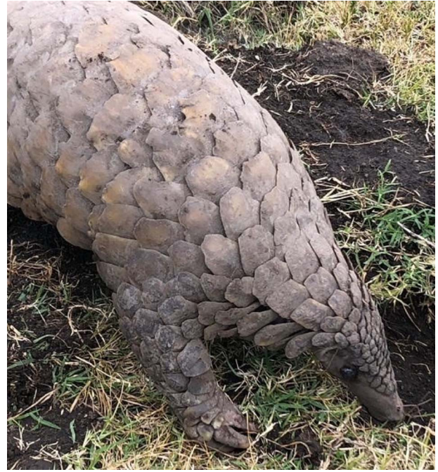
PLATE 3 Giant pangolin photographed during release after becoming trapped under an electrified fence. Photo was taken on the edge of the savannah–Afromontane belt in western Kenya, in August 2018.

A third record was reported in August 2018, c. 4 km west of the second sighting. A pangolin that had become trapped under an electrified fence was removed and relocated to a nearby forest. Videos and photographs were used to identify the animal based on its size, relative tail length, forelimb definition and movement suggesting the animal to be