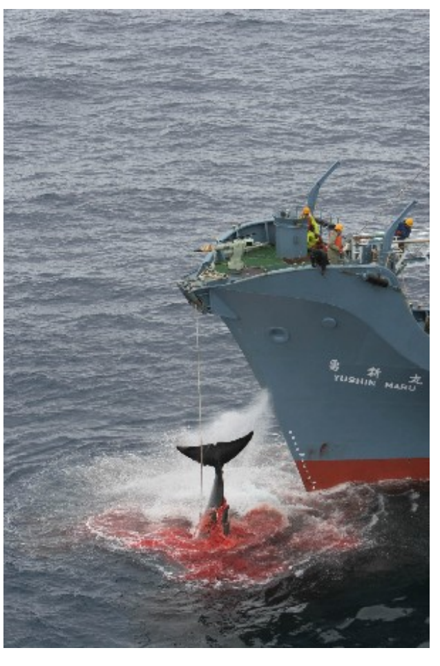
The Japanese catcher ship Yushin Maru harpoons a whale in the Southern Ocean, January 7, 2006.

The whaling issue then is, in the words of one environmentalist, 'a mess.'