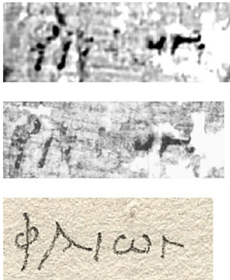
FIGURE 2: Phld. Ind. Acad. col. 33.1 (end of line): HSI, MSI, Neapol. disegno – Φιλίω`ν

Philo's name is also to be read in another passage of the Index Academicorum , specifically in col. 33.1. Bücheler (1869) transcribed it in the editio princeps as Φίλων, and Mekler (1902) followed him by printing Φίλων; Mette (1986–7) accepted a preliminary suggestion by Dorandi (Φ{α}i<λ>ων), who in his edition of the Index