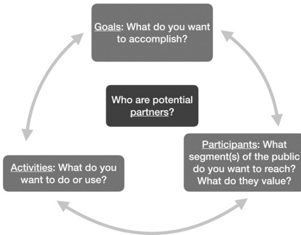
Figure 3 Visual representation of goal-directed design of public engagement with science, integrating consideration of goals, activities, and participants

The modes of engagement or activities in public engagement with science are similar to teaching and learning activities insofar as they are the things participants do or engage in in order to support achieving the established goal(s). Public engagement initiatives can involve a wide variety of different modes of engagement, and these different modes will be better suited to different goals. Modes of engagement can include, for instance, (1) traditional forms of science communication and journalism, like op-eds, public talks, news interviews, websites, and social media; (2) formal science education outreach to K-12 classes or teachers; (3) informal science education, such as activities at museums, zoos, libraries, and parks; (4) scientific research conducted in collaboration with members of the public, such as people volunteering to collect data about the birds in their backyards; and (5) outreach about science policy or to influence public policies. (This delineation of types of public engagement with science initiatives is developed in greater depth in Section 5 .)