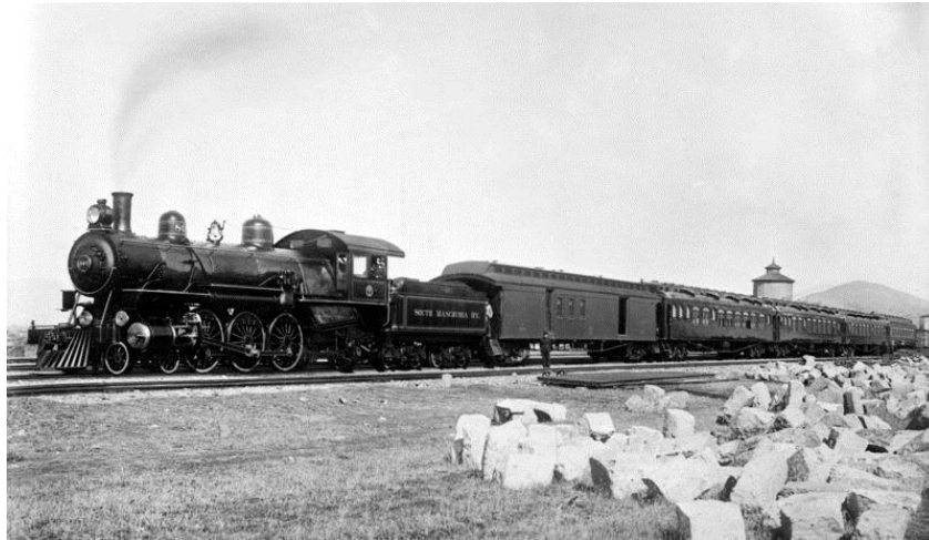
South Manchurian Railroad, symbol of Japanese power and industrialization

Brook argues that collaboration and resistance have been judged harshly not only by nationalist yardsticks but by norms of humanitarianism and other moral expressions that also do not do justice to the historical record. At the local- or even micro-level we see how a single act could have unimagined repercussions, as when lower level “collaborators” succeed in derailing the entire edifice of the occupation’s administrative structure; or when the resistance of the guerilla forces to the occupation could subject an entire population to devastating Japanese military recrimination. Brook also pays equal attention to the mentality of the Japanese agents who try to recruit Chinese supporters at the lowest levels of this enterprise. We are left to decide just how self-delusionary was the Mantetsu agent who saw himself fulfilling the great mission of saving China and Asia in the face of the unimaginable horrors perpetrated by his military.