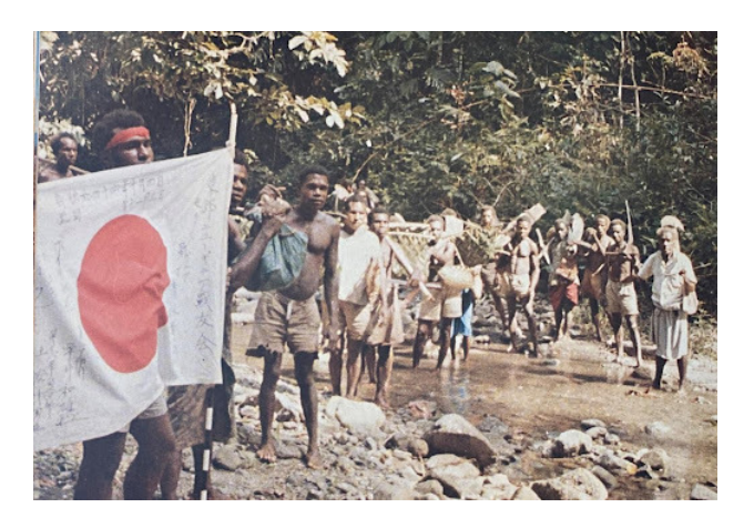
Figure 13: The caption notes: "In the region of Boikin, this is how we went to find the dead every day" (Tōbu Nyūginia senyūkai 1970, 92).

(Australian Government 2020). Nevertheless, the representation of New Guineans in the book of photographs from the 1969 mission, and in Nukuda's memoirs as well, demonstrates their roles for the Japanese mission as guides, carriers and laborer's, as in the illustration below.