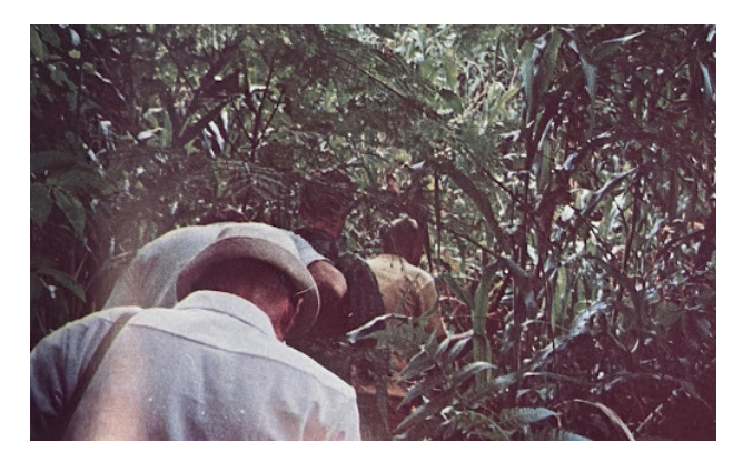
Figure 5: These two photographs are juxtaposed on the same page. The top photograph is captioned: "South of Lae, Kampayama, a forest denuded by Australian bombing (wartime Australian Army photograph)." New Guinean porters are faintly visible bottom right. The photograph underneath is captioned: "members of the search mission push through the jungle, dark even in daytime" (Tōbu Nyūginia senyūkai 1970, 99).

the veterans' perception of the distance between the war and their own present in 1969, symbolized by the juxtaposition of monochrome wartime images with the colorful representation of the same landscape as photographed by the veterans. The wartime photographs are pictures taken by Allied armies: aerial shots of impenetrable mountain ranges, or landscape depictions of swampy river mouths. The veterans took color photographs, twenty-five years later, of similarly impenetrable forests, of fast flowing rivers, and muddy flats, sometimes replicating closely the vista presented by the earlier wartime photographer. The depiction of New Guinea as a hostile natural environment during wartime serves to remind readers of the conditions in which soldiers served at the time. illustrating the common theme in New Guinea veteran memoirs that their enemy was the environment as much as Allied soldiers.