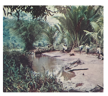
Figure 6: These two photographs are presented next to each other - a wartime American army photograph of New Guinean terrain, and next to it, the New Guinean helpers accompanying the searchers along Francisco creek from Salamaua (Tōbu Nyūginia senyūkai 1970, 26).

In addition, the contrast between wartime photographs and colorful contemporary photographs was a way to highlight a recurring theme in Japanese memoirs of the war in the Pacific: that this hellish war had taken place in a heavenly environment, a lost paradise. In the book, the remains themselves function as the device that ties the monochrome to the colorful, and so the past to the present. The 1969 photographs of skulls, bone fragments and pieces of military equipment excavated during the mission are largely monochrome, not because of the choice of photographic film,