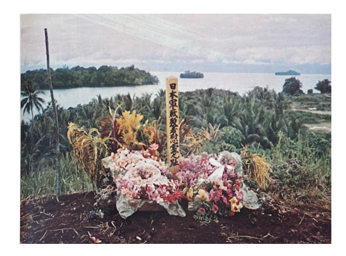
Figure 11: A memorial to Japanese fallen soldiers overlooking the port of Madang (Tōbu Nyūginia senyūkai 1970, 55).