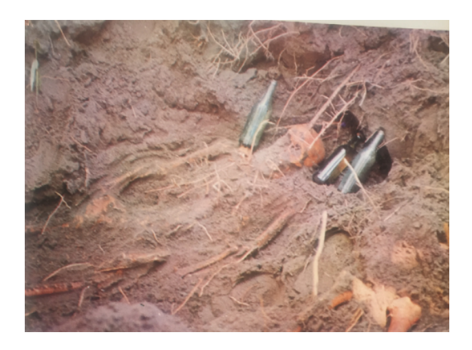
Figure 15: This photograph is captioned: "a body disinterred on the northern beach of Hansa bay. It was probably an officer, the cider bottles left as they were" (Tōbu Nyūginia senyūkai 1970, 61).

shown below, a disinterred skeleton, in a burial place now clearly embedded in the developing root system of a nearby tree, marks the passage of time through the growth of vegetation, and suggests the gradual disappearance of the bodies.