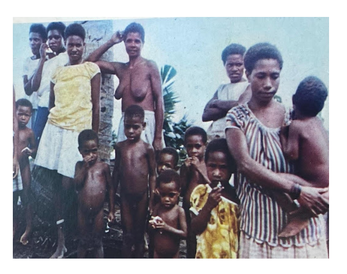
Figure 12: "Women and children of Sonamu village" (Tōbu Nyūginia senyūkai 1970, 55).

For all the grief and mourning that prompted the 1969 mission, it was also in part experienced and presented as tourism, a point which reflects the tension between military deployment and its opportunities for travel. This tension has been explored extensively in research on the deployment of American troops in bases across the world, noting the cognitive dissonance between the imposition, implicitly or explicitly violent, of military occupation, and the pleasurable exploration of other cultures as a leisure activity (Gonzalez, Lipman and others 2016). Debbie Lisle draws attention to the impact of broader global transformation and accompanying discourses on soldiers' experiences of local populations, a point she illustrates with American soldiers' exploitation of women and children during the Cold War (2016, 127). The way in which photographs demonstrate the gaze of privileged individuals at once as soldiers, tourists and voyeurs has been explored by Carolyn O'Dwyer's analysis (2006) of an American album of wartime photographs taken in Saipan. The visit of Japanese veterans to New Guinea in 1969, and their gaze as tourists, resonates with these analyses to some extent, not least because of