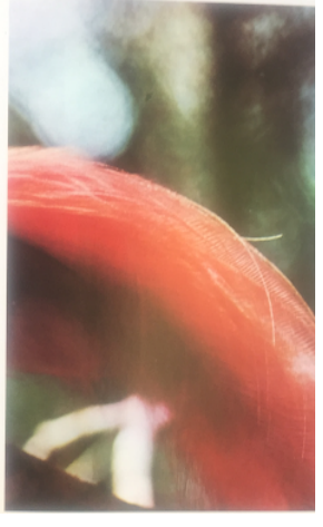
Figure 10: The photograph goes across two pages, with a simple caption: "Bird of Paradise" (Tōbu Nyūginia senyūkai 1970, front page).