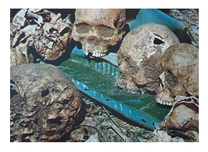
Figure 7: The short caption to this photograph reads: "Young lives, protecting the nation...." (Tōbu Nyūginia senyūkai 1970, 94).

In addition, the contrast between wartime photographs and colorful contemporary photographs was a way to highlight a recurring theme in Japanese memoirs of the war in the Pacific: that this hellish war had taken place in a heavenly environment, a lost paradise. In the book, the remains themselves function as the device that ties the monochrome to the colorful, and so the past to the present. The 1969 photographs of skulls, bone fragments and pieces of military equipment excavated during the mission are largely monochrome, not because of the choice of photographic film,