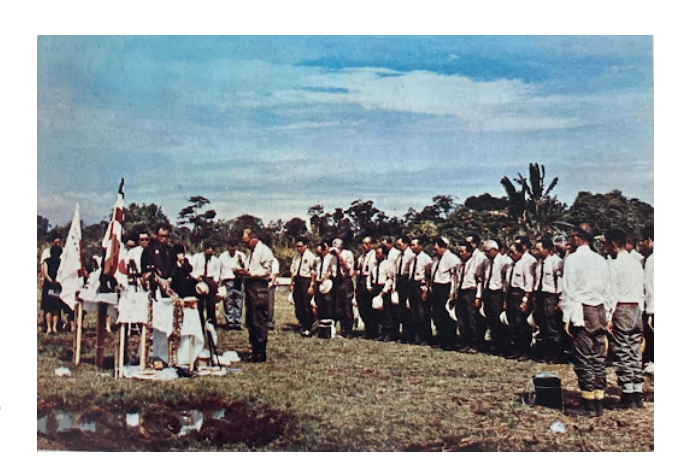
Figure 4: A commemorative ceremony on the site of the former military airport at Malahang, Lae, on 29 October 1969. The

Takeo (later Prime Minister, 1976-78), Foreign Minister Aichi Kiichi, Minister of Defense Arita Kiichi, members of the Upper House, members of the Lower House, representatives of national associations of prefectures and municipalities, as well as important private backers from major railways, banks, the Yasukuni Shrine, and famous figures from the entertainment industry such as wartime and postwar songstress Watanabe Hamako (Tōbu Nyūginia senyūkai 1969). Despite the international reach of the searches for remains, there is no evidence that the New Guinea Association asked for funding outside of Japan. The list of participants in the 1969 mission include a Japanese employee of the Australian Airline Qantas, the airline most likely to service New Guinea at the time, but the terms of his participation are unclear. The colonial administration of New Guinea, the Australian government, certainly acquiesced to the Japanese veterans' visit, especially since preparations for New Guinea's planned 1975 independence included consideration of the potential of Japanese investments in various local industries (Doran 2006).