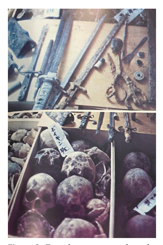
Figure 2: Two photos presented on the same page. The caption to the one above reads: "Mementos of the past." The one to the photo below reads: "while crying ..." (Tōbu Nyūginia senyūkai 1970, 93).

This conceptual framework is particularly useful to the study of discourses and debates about the repatriation of remains. War remains are "sticky objects" par excellence: they prompt from their viewers a somatic response