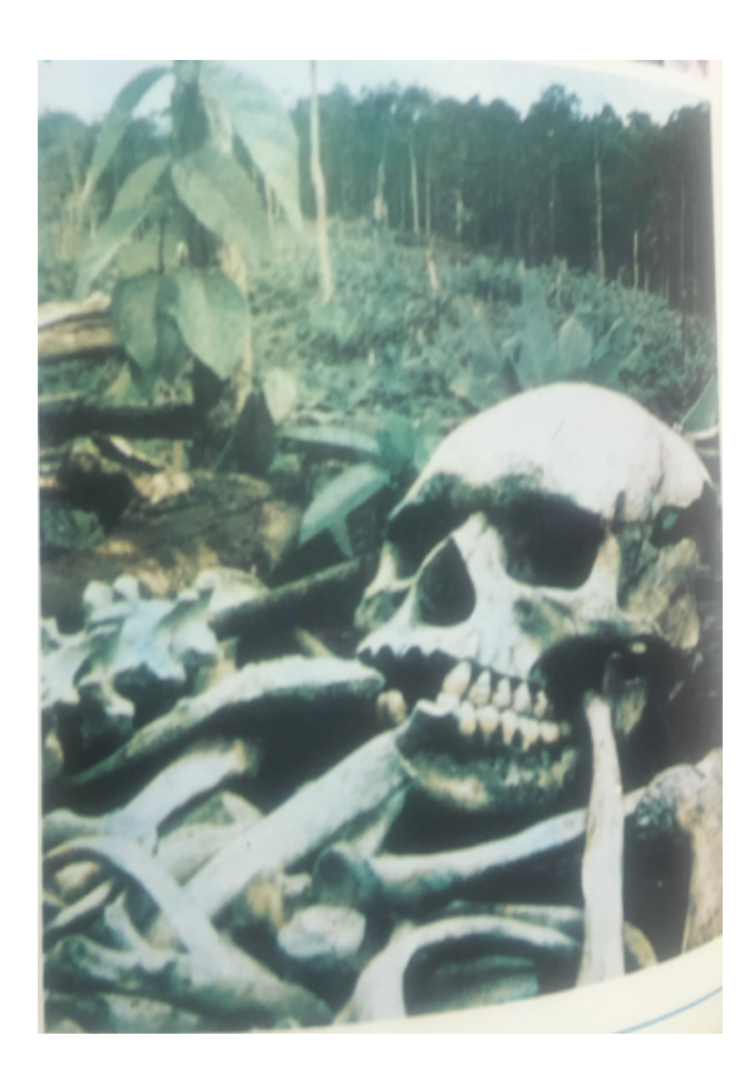
Figure 1: Tōbu Nyūginia senyūkai 1970, 74.

This article analyses the contents of this collection as an attempt to translate the war experience for an audience at home in immediate and emotionally engaging ways. The book was published just a few months after the mission itself. The first few pages consist of an overview of various battlefields in Eastern New Guinea over the three years of the fighting, authored by former Colonel Tanaka Kanegorō (Tōbu Nyūginia senyūkai, 1970). The larger proportion of the book is taken up by the photographs themselves, captioned only by a short sentence if at all, over some 130 pages containing one to three photographs each. They depict the search party, the New Guinean villagers who helped them, and amongst landscapes, animals and plants, also the bones