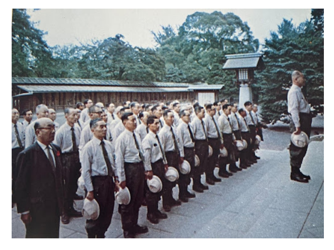
Figure 3: The short caption to this photograph tells us that the fifty-five members of the mission visited Yasukuni Shrine on 3 October 1969, before their departure (Tōbu Nyūginia senyūkai 1970, 15).

carrying backpacks in the heat, looking for their friends, your son, husband, father..." (Tōbu Nyūginia senyūkai 1970, ii). The introduction thus highlights the double sacrifice of the veterans for Japan, the first as soldiers in their youth in an awful battlefield, and the second made again on behalf of families in Japan, despite the veterans' advancing age and the physical toll of the search in tropical heat. This second sacrifice was also made on behalf of the dead themselves: as the introduction states, "going back to visit our dead comrades, whose graves are covered in moss in the middle of the jungle, is the duty of the survivors, and the fulfilment of the oath we took." The duty of survivors to the dead is a common theme of the accounts of those who searched for remains (Happell 2009; Trefalt 2015), and it speaks to their attempt to fulfill the terms of the "implied contract" between Japan and its war dead mentioned earlier.