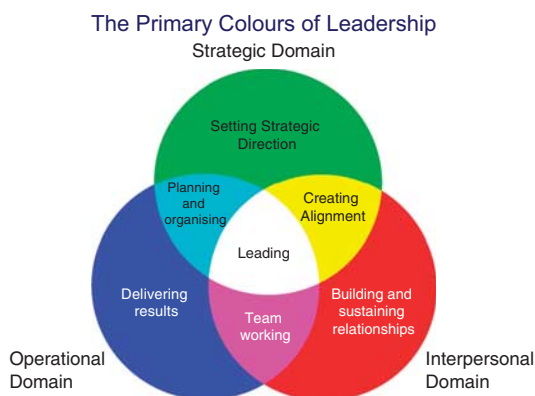
Figure 2 The Primary Colours of Leadership

influence and persuasion whether individually, in teams or in larger groups.