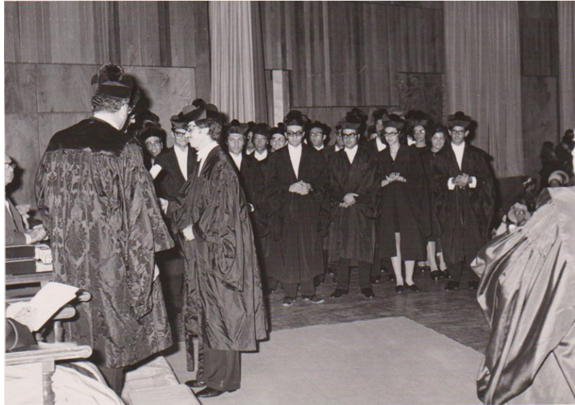
Figure 5. Graduation Convocation ceremony.