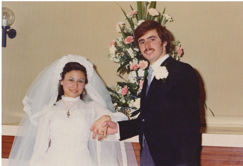
Figure 6. Tying the knot 1974.