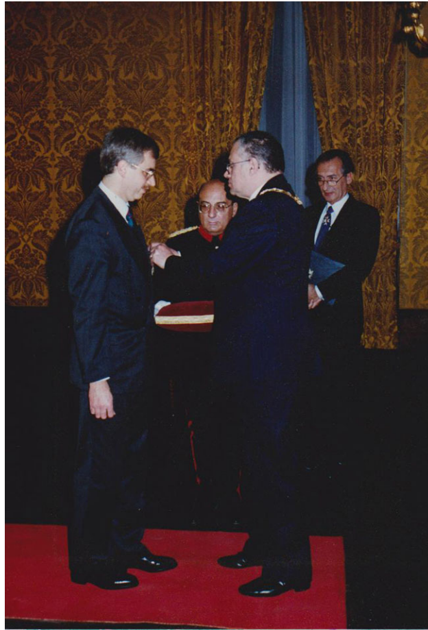
Figure 8. Receiving Order of Merit from President of Malta.