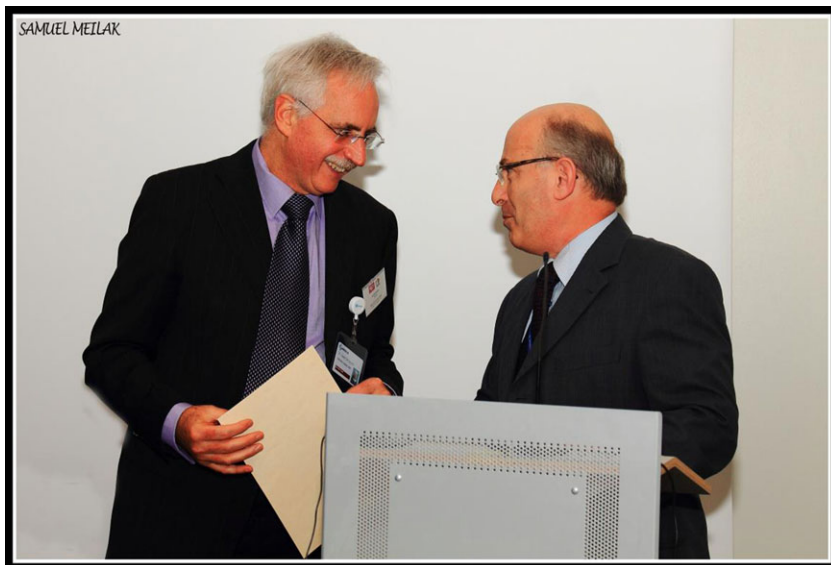
Figure 9. Receiving professorship from University of Malta.