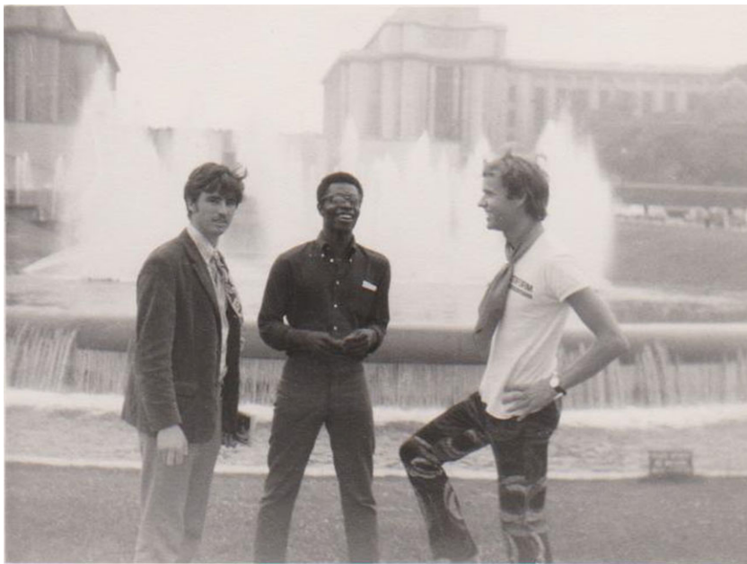
Figure 4. First conference representing Malta at the International Federation of Medical Students Association in Paris 1970.