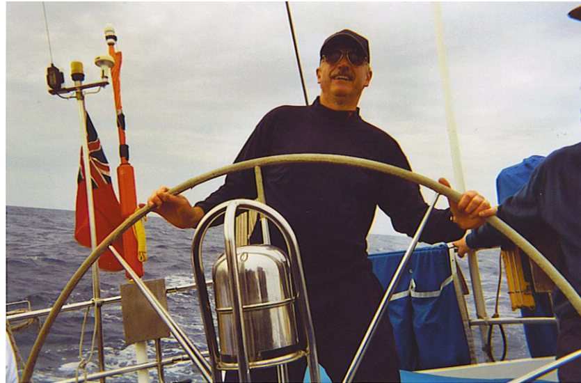
Figure 10. Boating, one of his passion.

Award by British Congenital Cardiac Association in 2015, and he became an Honorary Member of AEPC for his contribution to the field of paediatric cardiology.