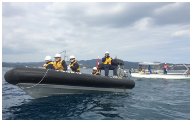
Japanese Coast Guard monitoring media at Henoko

According to Nago City's US Base Affairs Section, between last November and February 4, 12 demonstrators were injured in confrontations with the police and Coast Guard - 5 of which were taken to hospital by ambulance. Injuries verified by Nago City include a man whose rib was broken when he was shoved in the chest by a member of the Coast Guard on January 16 and a 49 year-old man injured by the riot police on January 23 who was left with injuries to his hand requiring a month to recover.