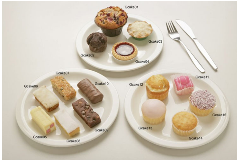
Fig. 2. (colour online) Example of guide photograph showing range of portion sizes available.