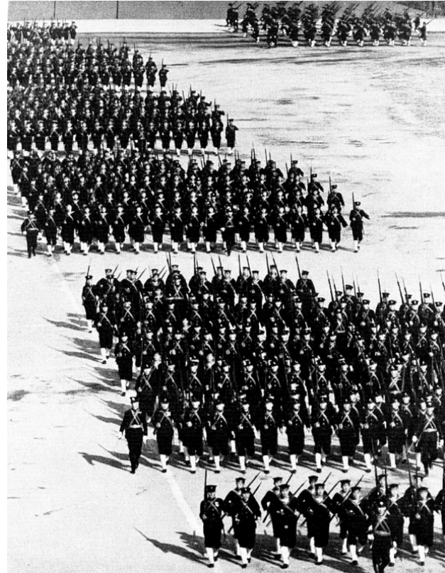
Figure 8. Japanese army. Figure 9. Japanese infantry. Figure 10. Japanese navy. From German press, circa 1940-43.