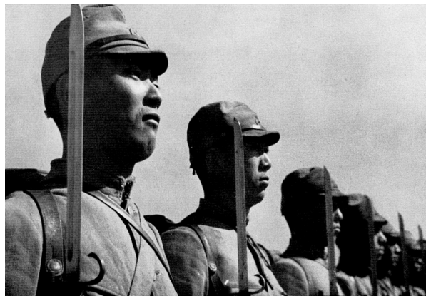
Figure 6. Japanese soldiers in German press, circa 1940-43.

From very early on National Socialist authors showed special interest in Buddhism, mainly because of their race theory, particularly their assumptions regarding Aryans, whom they saw as the ancestors of the Germanic peoples. H.F.K. Günther, the leading National Socialist theorist dealing with racial questions, depicted Buddha as an Aryan, probably light-skinned and blue eyed, and explained the teachings of Buddha as being “a life teaching for individual nobles” ( „Lebenslehre für einzelne Edeling“ ), demanding “self-discipline and inner superiority” ( „große Selbstzucht und innere Überlegenheit“ ). 8 A National Socialist indologist described Buddha as an Aryan hero, as a “warrior yogi” ( „Kriegeryogi“ ), and presented his early followers as examples of “passive heroism”. 9