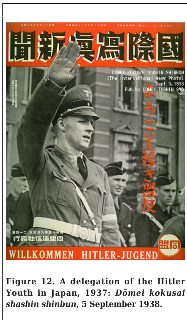
Figure 12. A delegation of the Hitler Youth in Japan, 1937: Dōmei kokusai shashin shinbun , 5 September 1938.

confirmed in the extant files of the Foreign Office or the Ministry of Education. At any rate, Dürckheim was given a research assignment in Japan once more ("a study of the foundations of Japanese thought and of strengthening friendly relations between Japanese scholars and Germany") and, again, his stay was for a limited period of time only, until October 1942. This time his journey was funded by the Foreign Office, with such generosity that Dürckheim could afford a personal secretary, a spacious apartment, and a car. 32