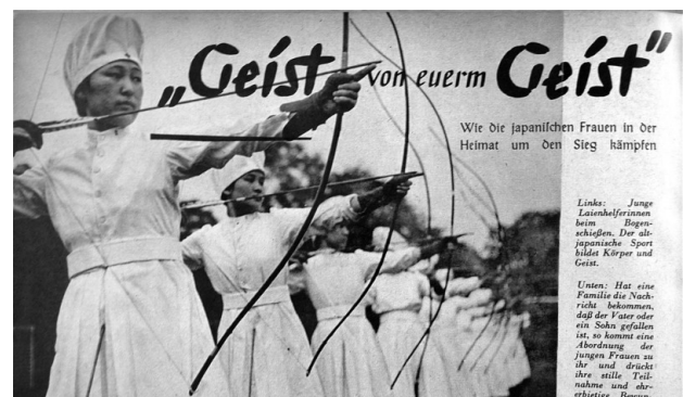
Figure 2. Nogi, the last samurai: the Japanese hero of Port Arthur, Ronald E. Strunk.