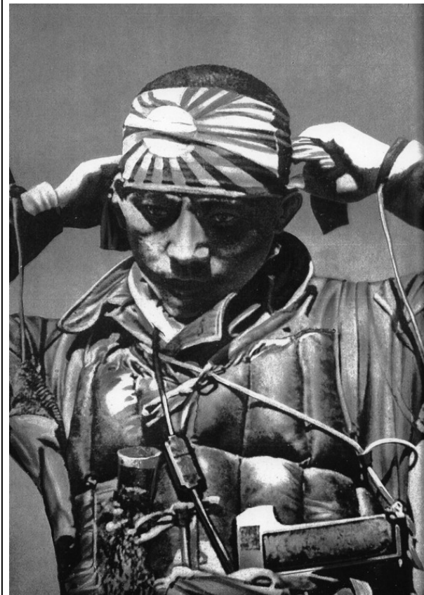
Figure 11. "Jibaku" for the future of his country: determined to die, the pilot ties

Sonthofen (Bavaria), Himmler again expressed his respect for the bravery of Japanese soldiers, who had no fear of death, but went on to say "that we, the world's oldest civilized people and its oldest warrior people, do not need a foreign race to provide us with examples or to serve as role models. The history of German soldiers and German women can most certainly present us with as many numerous examples and role models as can that of the Japanese, Chinese, or any other people." 23 (See figure 11.) Praise of Japan disappeared in publications of the SS. In other publications it continued but was superseded everywhere by depictions of the Germanic heroes of the Edda, the medieval Nibelungenlied, and the myth of Walhall. These were now to provide the dominant role models. 24