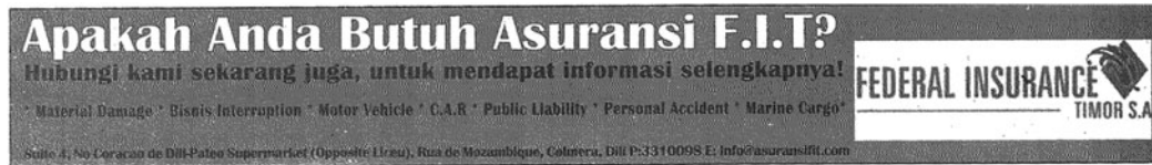
Figure 1. Federal Insurance advertisement