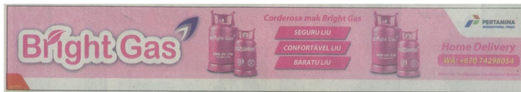
Figure 2. Pertamina advertisement