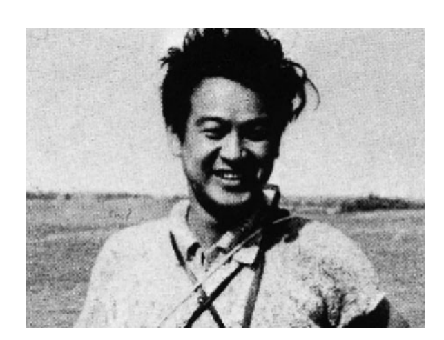
Figure 1. Naomichi Ishige in his early career.