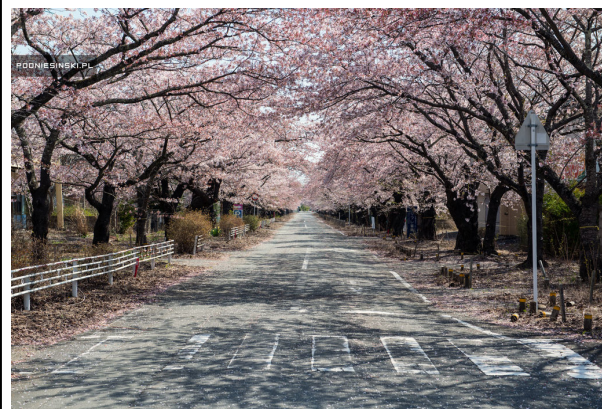
Main street with flowering cherry trees

The nuclear irony of fate meant that this Japanese symbol of new, nascent life today blooms in the contaminated and lifeless streets of Tomioka. Will the city and its residents be reborn, along with the cherry trees blossoming in solitude and silence? Undoubtedly, the last word shall belong to them alone.