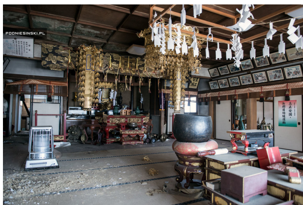
Overtured shelves of rental video shop Temple