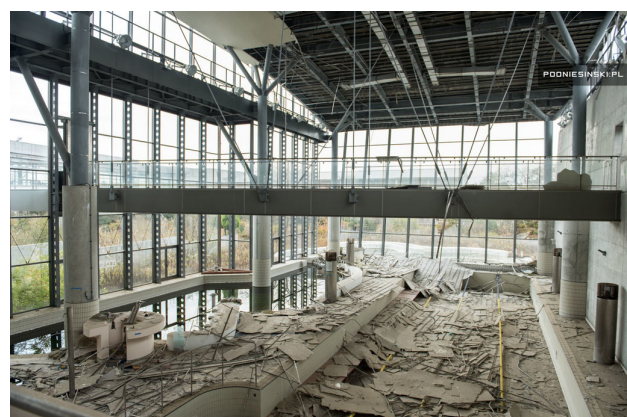
Swimming pool complex Main pool