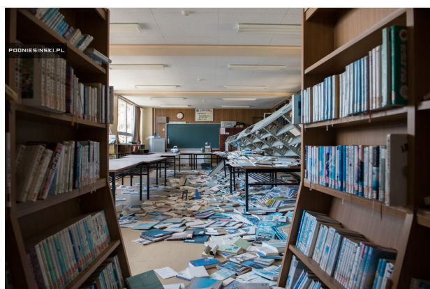
School School library