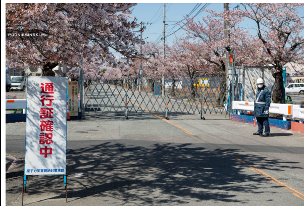
Entrance gate to the closed zone in Tomioka