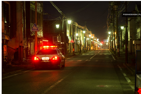
Nighttime police patrol