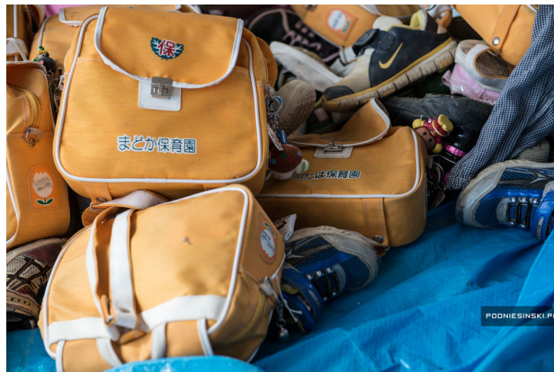
Kindergarten. The dosimeter reading here is 9.3 uSv/h. Children's school bags