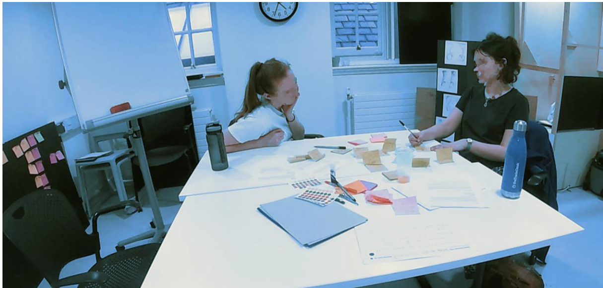
Figure 3. Experiment setup with a pair of participants