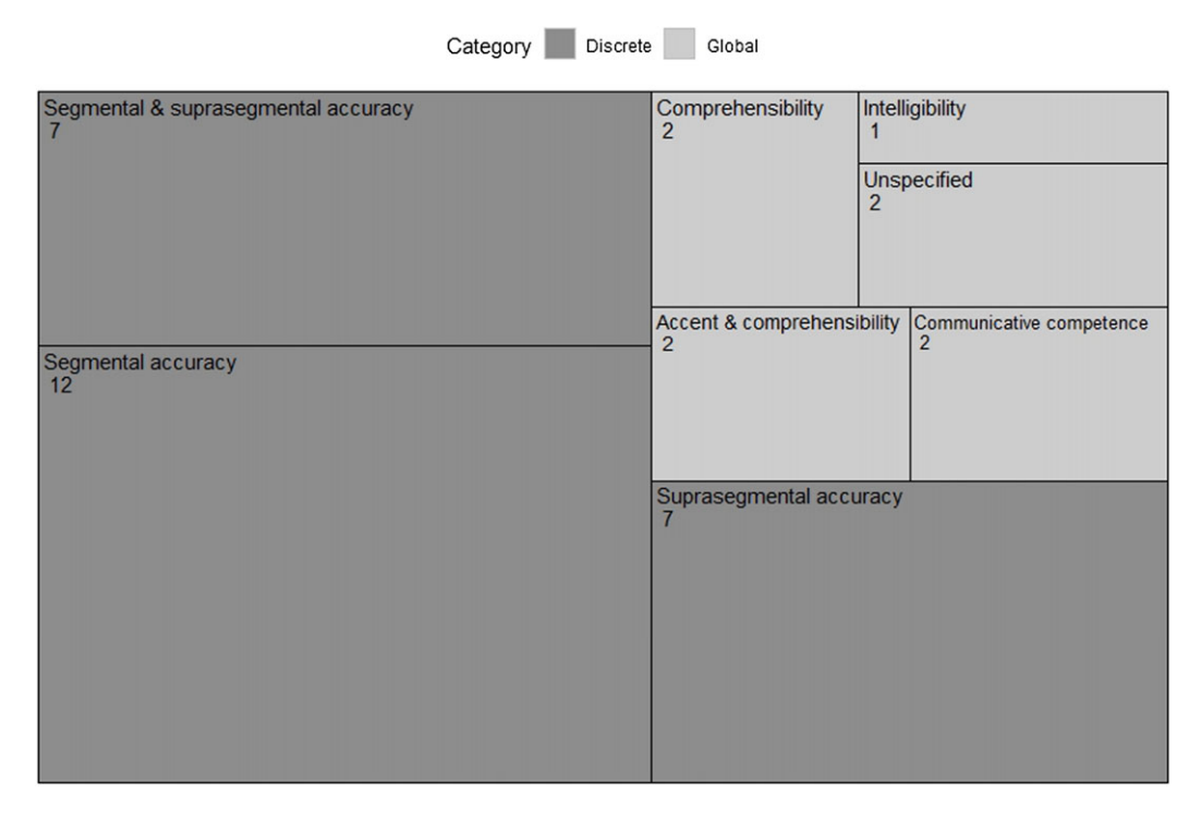
Figure 3. Discrete and global measures of pronunciation production improvement.

knowledge gap can lead to a limited applicability of CAPT research findings and missed opportunities to optimize CAPT systems that could be effective with other languages.