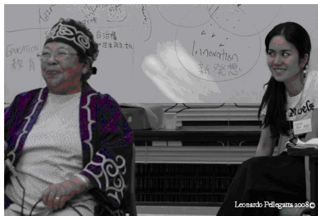
Ukocaranke on Education: Workshops lead to intergenerational discussion