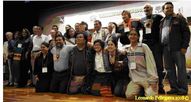
Indigenous Delegates and Ainu organizers at IPS Opening

had a major ripple effect. This impacted not only Ainu people but represents a big step forward for rights reclamation for indigenous people overseas as well." [7]