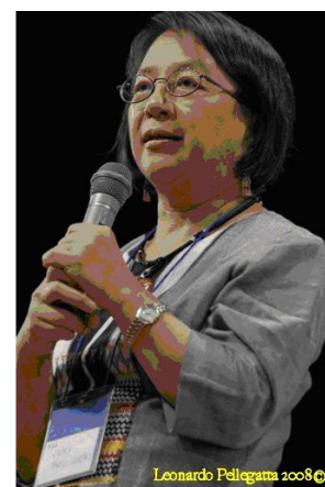
Tauli-Corpuz keynote on indigenous peoples and sustainability

Ainu alignment toward domestic action is in sharp contrast to the focus of IPS indigenous delegates who benefit from treaties and more progressive domestic policies. Many are involved with international organizing and trans-national ventures such as collaboration and leadership training; others serve as leaders of regional indigenous blocks and represent these constituencies in international contexts. They are therefore apprised of the techniques of international law and familiar with the vernacular of international legal-speak. Producing the Nibutani Declaration was an extension of ongoing work on the DRIP for international indigenous leaders.