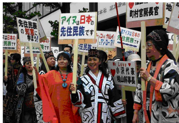
Ainu Women: A vocal majority for indigenous recognition

The Ainu Association also piloted initiatives that were reminiscent of campaigns to support the proposal for the “Ainu New Law” in 1984, which was substantially revised and adopted as the Ainu Cultural Promotion Act (1997), Japan’s first multicultural legislation. Focusing initially on Hokkaido legislators and later expanding to national coalition party leaders, the Association orchestrated visits to legislators, recruiting lawmakers to Ainu political rights work. In March 2008, their efforts bore fruit when the “Legislative Coalition to establish Ainu People’s Rights” was established to push for a resolution “recognizing the Ainu’s pride and dignity as indigenous peoples” ahead of the G8 meetings in July. [24] On May 22, the association coordinated a march on the nation’s capital, attended by more than 400 Ainu from across Japan. Adorned in traditional kimonos and waving placards anticipating the G8 environmental theme, “Ainu are kind to the earth” and “the Earth is on loan from our children,” the group marched toward the Diet buildings. Here Ainu Association directors formally read and delivered a formal request for indigenous rights to assembled lawmakers.