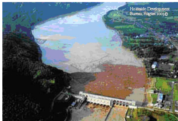
Aerial view of Nibutani Dam, nearly submerged by silt and driftwood during the 2003 typhoon

argue that they have a special mandate to address the global environmental crisis because they are directly dependent on the natural environment for their livelihood, experience immediate consequences when the environment fluctuates, and have observed and experienced global warming-related changes for decades.[49] Mitigation measures now being introduced to combat global warming have also adversely affected indigenous communities in what might be dubbed “neo-energy colonialism.” During the last century, indigenous peoples’ lands were targeted for fossil fuel extraction; now indigenous-managed lands are being targeted for corn, soybean, and oil palm plantations for bioethanol production. [50] Indigenous peoples are experiencing loss of traditional gathering and agricultural lands due to competition with biofuel plantations and hydroelectric dams. [51]