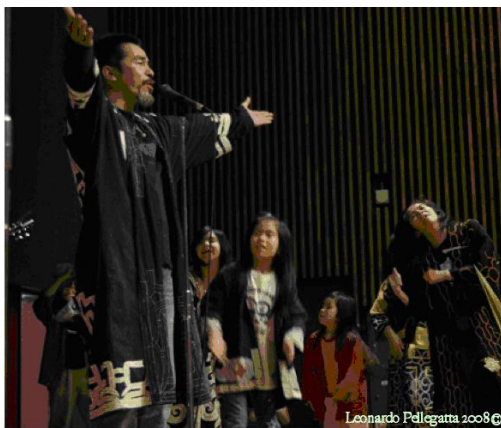
Ainu rock in the family: Ainu Art Project performs traditional songs with hard rock beat