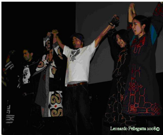
Resistance music: Ainu Rebels blend hip-hop and electronica to create a new Ainu vibe

organized by young Ainu members of the Steering Committee, Ainu youth broke away from the politicized rhetoric of the summit to celebrate ethnic distinctiveness through performance, as an articulation independent of politics.