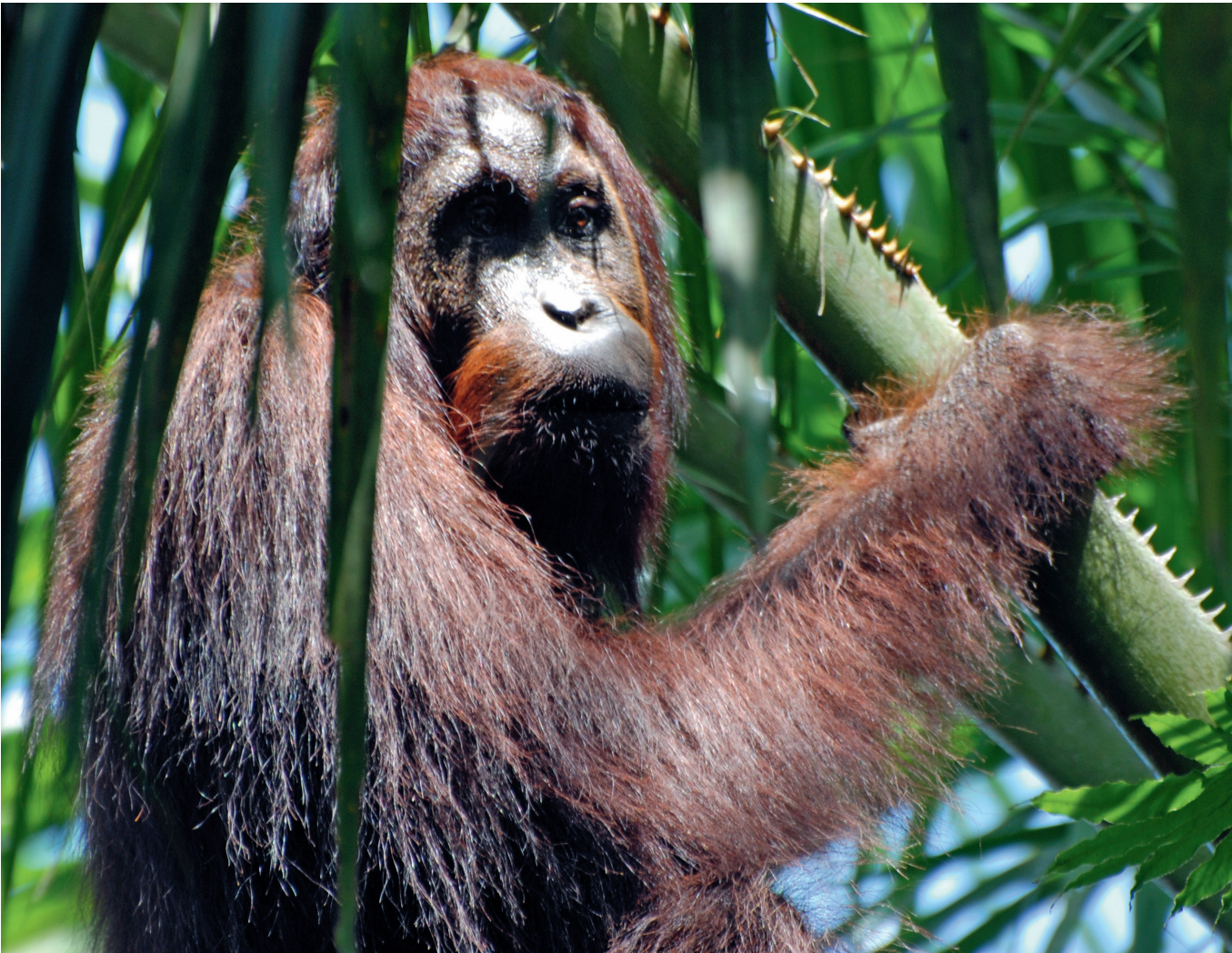
Photo: When species conservation goals conflict with the interests of human individuals and collectives, they can generate difficult moral dilemmas whose resolution requires careful consideration and respect. Orangutan in an oil palm plantation.

of interspecies interdependence, attuned to the flourishing of both humans and animals as members of their ecological communities (Batavia et al. , 2021; Kirby, Steindl and Doty, 2017; Nieuwland, 2020).