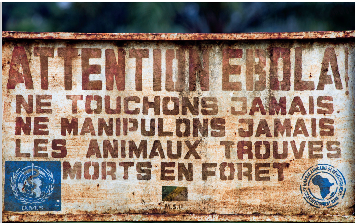
Photo: Is it justifiable to spend significant resources on a potentially unachievable goal of protecting apes against Ebola virus disease (or another threat to their health) in situ while the health needs of neighboring human communities remain unmet due to a lack of funds? © Pete Oxford/Minden/naturepl.com

60 mountain gorillas ( Gorilla beringei beringei ) to protect them against what they presumed was measles, although the diagnosis remained unconfirmed (Cranfield and Minnis, 2007).