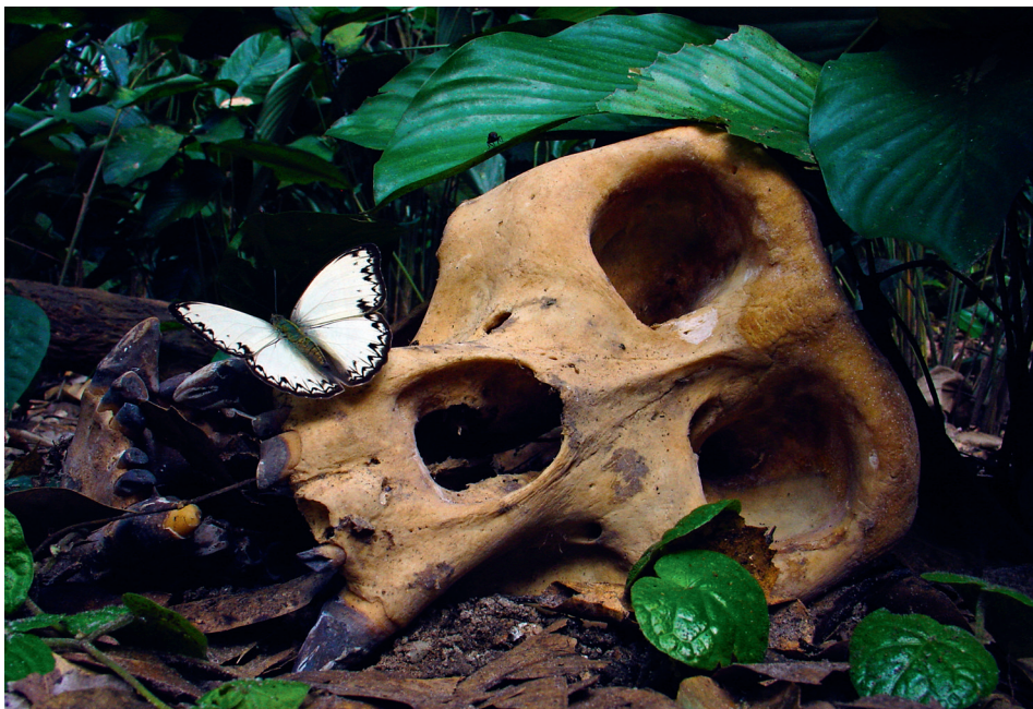
Photo: Some conservation policies implicitly treat individual animals as irrelevant or expendable, while some frame them only in terms of their contribution to the species overall or to other conservation goals. Skull of a western lowland gorilla. © Jabruson/naturerepl.com

There are many ways to include animals in ethical decision-making. One way is to consider who or what matters morally, and