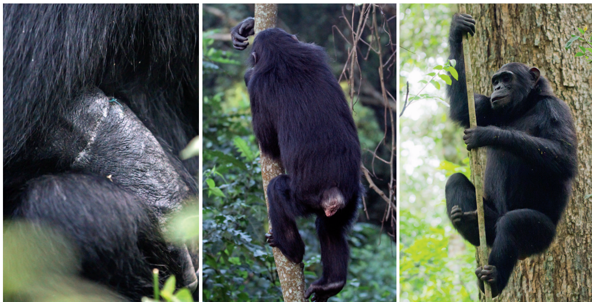
Special two months after intervention (left and middle) and gripping a branch three months after intervention (right).