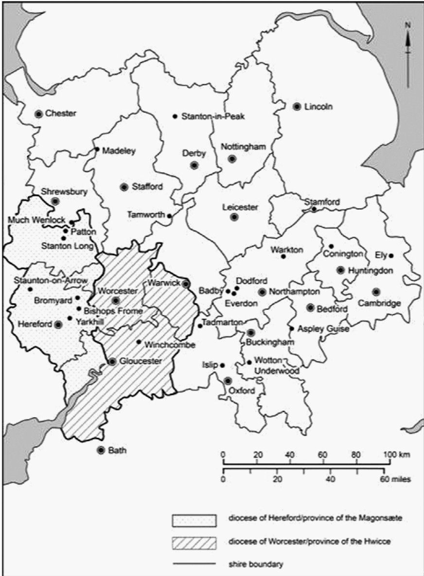
Figure 2: The midland shires in 1086 and, mapped onto them, the contemporary dioceses of Hereford and Worcester, all shown at their estimated extent. The two dioceses arguably mirror the extents of the former Mercian provinces of, respectively, the Magonsæte and the Hwicce. Named places are those referred to in the article. Map by author.