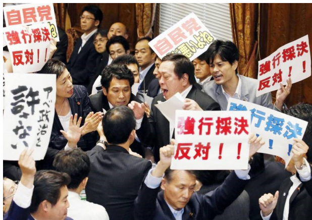
Angry scenes in the National Diet as the governing parties ram through security legislation

Three Principles of Defense Equipment Transfers; revised ODA Charter; revised National Defense Program Guidelines; and currently legislation to enable the exercise of collective self-defense, US-Japan relations (revision of the Defense Guidelines, pushing ahead with the Futenma Replacement Facility; attempts to complete the Trans-Pacific Partnership), and Japan-East Asia relations (historical revisionism in regard to musing on the legitimacy of the Kōno and Murayama statements, and the 2013 visit to Yasukuni Shrine; the pursuit of values-oriented and hyper-active diplomacy; and the ‘encirclement’ of China). Indeed, for much of Abe’s second period in office, this agenda has seemed irresistible as the prime minister has looked to challenge domestic and international taboo after taboo, and thus to finally bring to an end the ‘post-war regime’ and usher in Japan’s return as an autonomous great power, supposedly an equal partner of the US, and a state capable of exercising leadership in East Asia (or a code word for countervailing leadership against China’s rising influence).