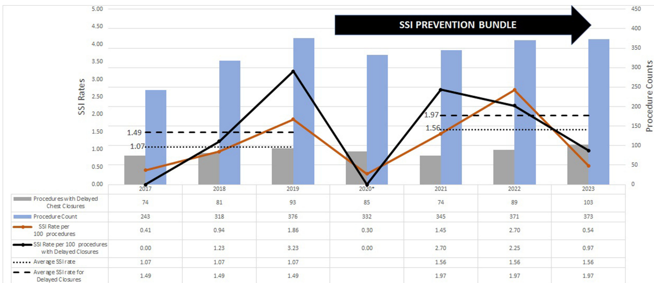
Figure 1 Summary of Pediatric Cardiothoracic Procedure Counts and Surgical Site Infection (SSI) rates from 2017 – 2023 in a Single Pediatric Center. *Year 2020 rates were excluded from comparative analyses to account for bundle implementation