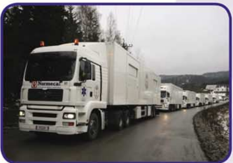
All kinds of clinics or hospitals in MultiSpace