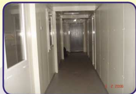
Inside MSF Hospital in Hattian Bala

Number One in the world for partial and turn key solutions incl. Transportation, Erection, Management, Training, Maintenance, Education, Administration, Storage, Out sourcing, Medivac, etc.