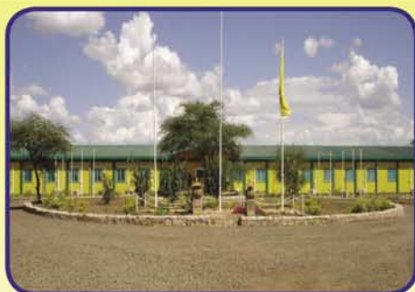
KATIKO Referral Hospital, Southern Sudan