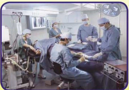
NorBase single and expandable containers