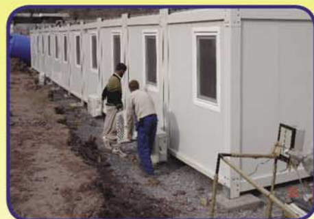
MSF Hospital, Hattian Bala, Pakistan