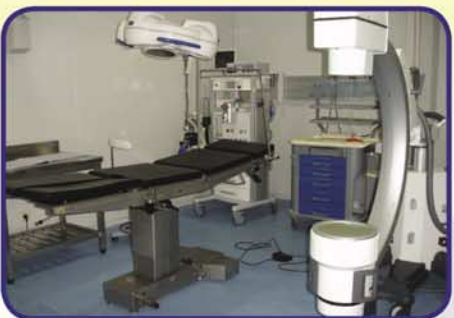
Inside OT in KATIKO Referral Hospital