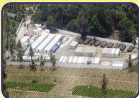
Thai Tsunami Victim Identification Centre