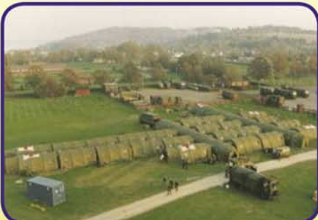
Rofi inflatable tents