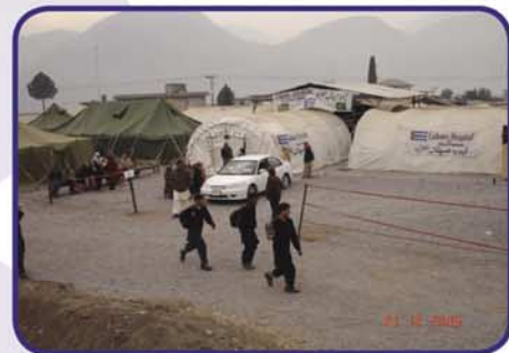
Cuban Hospital, Muzaffarabad, Pakistan