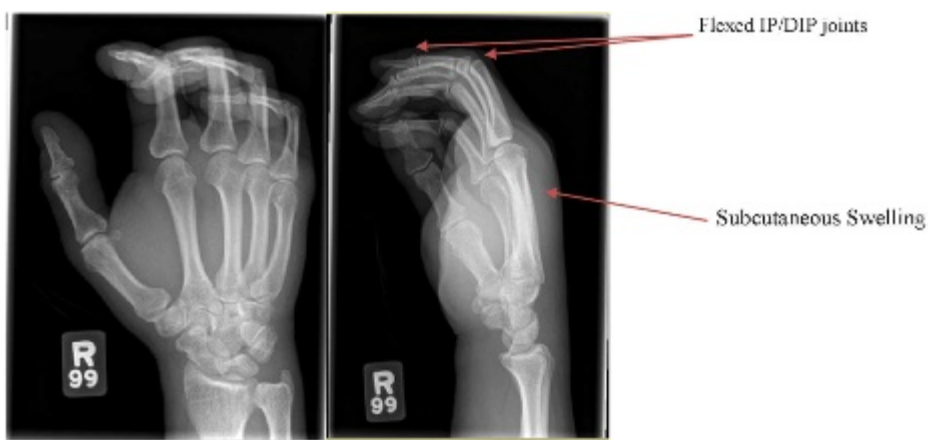
Figure 1. Anteroposterior and lateral radiograph views of the hand. Multiple views show prominent soft tissue swelling about the distal forearm and along the dorsal aspect of the hand. No gas is seen within the soft tissues. The underlying bone is also unremarkable. Note that there are flexion deformities noted at the proximal interphalangeal joints, which may be related to the soft tissue swelling. DIP = distal interphalangeal; IP = interphalangeal.

The digital flexor tendon sheath is a double-walled mesothelial structure with a closed space between the visceral layer adherent to the flexor tendon and the