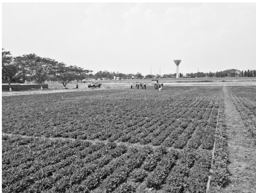
Figure 5.2 Day laborers work in an experimental peanut field at ICRISAT's Hyderabad campus, 2016.

marketing, distribution and transport systems for exports of raw materials and commodities from developing countries. 54