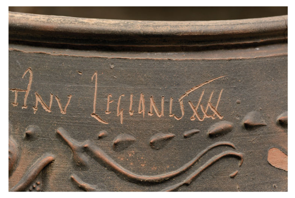
FIG. 4. The Colchester Vase inscription. Detail of the words LEGIONIS XXX.