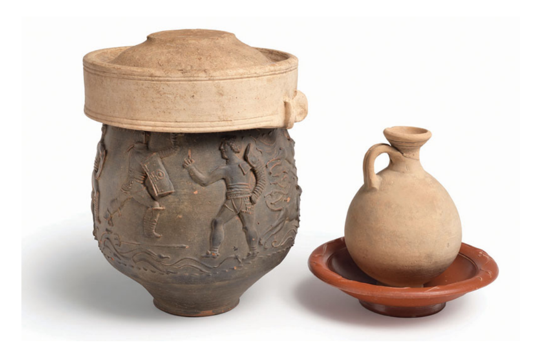
FIG. 1. The Colchester Vase burial group, including mortarium lid, dish and flagon, COLEM:PC.727-730.

affinities can be found in the companion paper.<sup>4</sup> Re-examination of the lettering, it will be argued, identifies the inscription as being cut before firing rather than afterwards, as current orthodoxy has it. Setting the inscription and images in the wider body of evidence for games enriches the insights which can be derived from the names and associated information into arena performers in the north-west provinces. Undertaken as part of Colchester Museums' Decoding the Dead project, osteological and strontium isotope analysis of the well-preserved cremated bones within the vessel enable them to be identified as the remains of a non-local male of 40+ years. Drawing on our study and its companion paper, the biography of the vessel and its implications for the understanding of the provision and celebration of gladiatorial games in Colchester are explored.