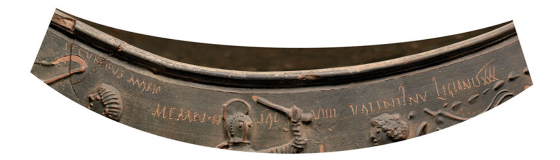
FIG. 2. The inscription below the rim of the Colchester Vase.

higher resolution images of the inscription, challenges current orthodoxy concerning the text's creation. The evidence of lettering is examined first before re-assessing the names of the performers and their associated attributes.<sup>7</sup>