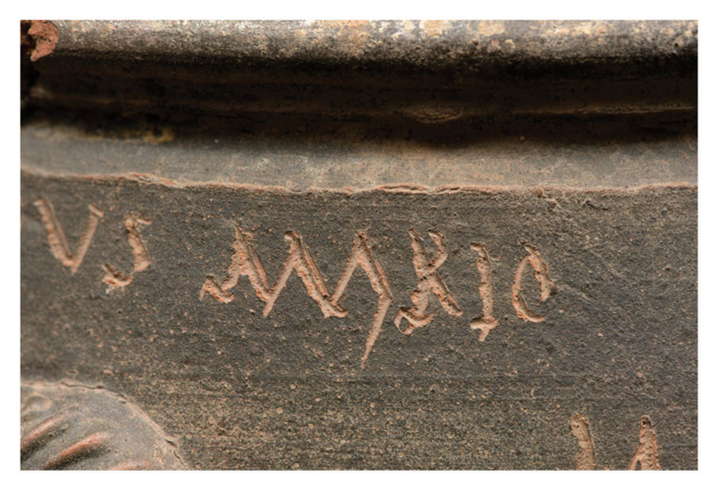
FIG. 5. The Colchester Vase inscription. Detail of the word MARIO.

Some letter forms, for example the S and L of legionis , indicate a wider affinity with Old Roman Cursive writing.<sup>9</sup>