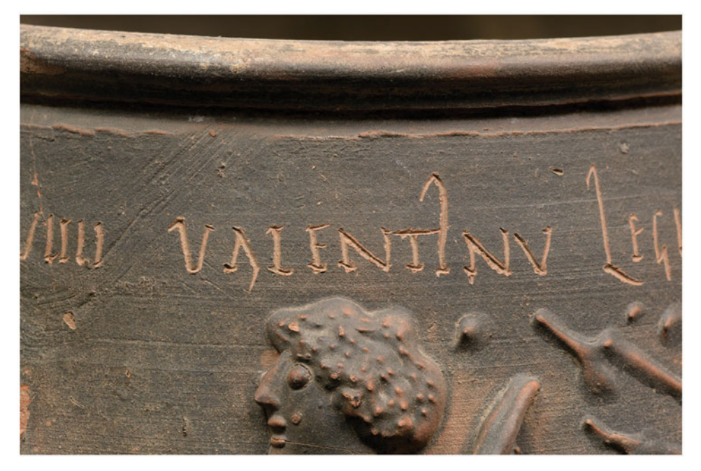
FIG. 3. The Colchester Vase inscription. Detail of the word VALENTINV.