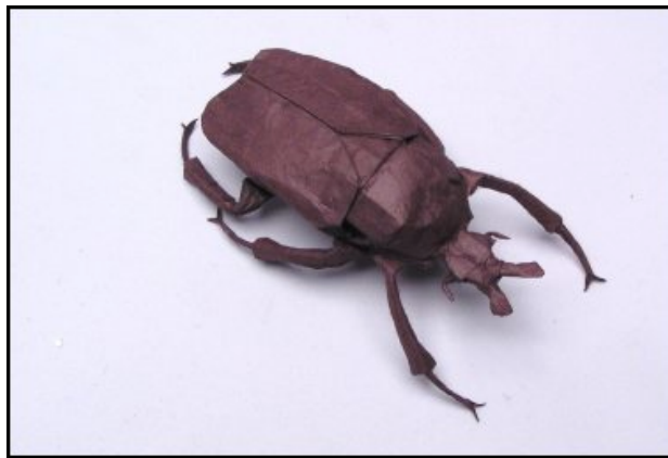
Lang's Goliath's beetle

help with designing, all of which enabled the development of increasingly complex folding techniques. In 1970, no one could figure out how to make a credible-looking origami spider, but soon folders could make not just spiders but spiders of any species, with any length of leg, and cicadas with wings, and sawyer beetles with horns. For centuries, origami patterns had at most thirty steps; now they could have hundreds. And as origami became more complex it also became more practical. Scientists began applying these folding techniques to anything—medical, electrical, optical, or nanotechnical devices, and even to strands of DNA—that had a fixed size and shape but needed to be packed tightly and in an orderly way. By the end of the Bug Wars, origami had completely changed, and so had Robert Lang. In 2001, he left his job—he was then at the fibre-optics company JDS Uniphase, in San Jose—to fold paper full time.