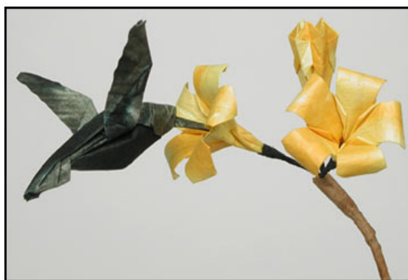
Lang's trumpet vine blossom

In the mid-nineteen-forties, the American folklorist Gershon Legman began studying origami. Legman was a man of diverse inclinations: he collected vulgar limericks, wrote a book about oral techniques in sexual gratification, and is credited with having invented the vibrating dildo when he was only twenty. After becoming interested in origami, he made contact with paper-folders around the world—most significantly, Akira Yoshizawa, a Japanese prodigy who, before being recognized as an extraordinary talent, made a meagre living by selling fish appetizers door-to-door in Tokyo. What made Yoshizawa extraordinary was that he presented the art for the first time as a medium that could be creative and expressive—he devised tens of thousands of models, and was particularly famous for his gorillas. In 1955, Legman organized an exhibition of Yoshizawa's work at the Stedelijk Museum, in Amsterdam. Yoshizawa got even more notice the following year, when Robert Harbin published his book "Paper Magic." Harbin was the preëminent British magician—he was the first to appear on television, and he developed the now classic "Zig-Zag Girl" illusion, in which the magician puts his assistant into a cabinet and saws her into thirds. His book, a best-seller, praised Yoshizawa, whose work was such a departure that it might have seemed that there was no further you could go with a single piece of paper and some folds.