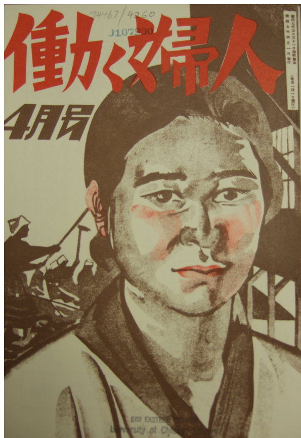
Figure 2: Cover of Working Women ( Hataraku fujin ), April 1932

Yuriko's arrest on April 7, 1932, occurs about halfway through "Spring 1932." She returns home to find policemen have made themselves at home, and they take her to jail. Yuriko's narrative builds slowly, conveying convincingly what it is like to be thrust into demoralizing living conditions indefinitely: she describes her cell and its squalor, the substandard food, and the interrogations. She is repeatedly questioned about her relationship to the illegal Japanese Communist Party, and it is suggested that even members of legal left-wing organizations will be treated like criminals. She is repeatedly questioned about her work for Working Woman , especially the April 1932 edition. (See figure 2.)