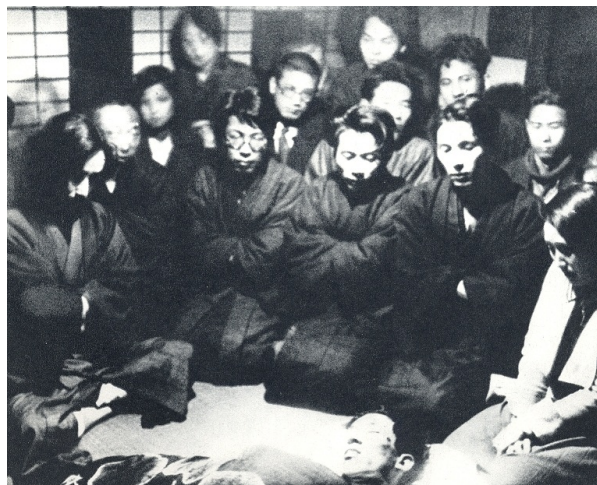
Figure 1: Mourners gathered around Kobayashi Takiji's corpse, February 1933

Torture frames the proletarian movement—from Kobayashi Takiji's story of the infamous round-up and torture of suspected leftists on March 15, 1928, to the death of Kobayashi himself by torture while under interrogation on February 20, 1933.