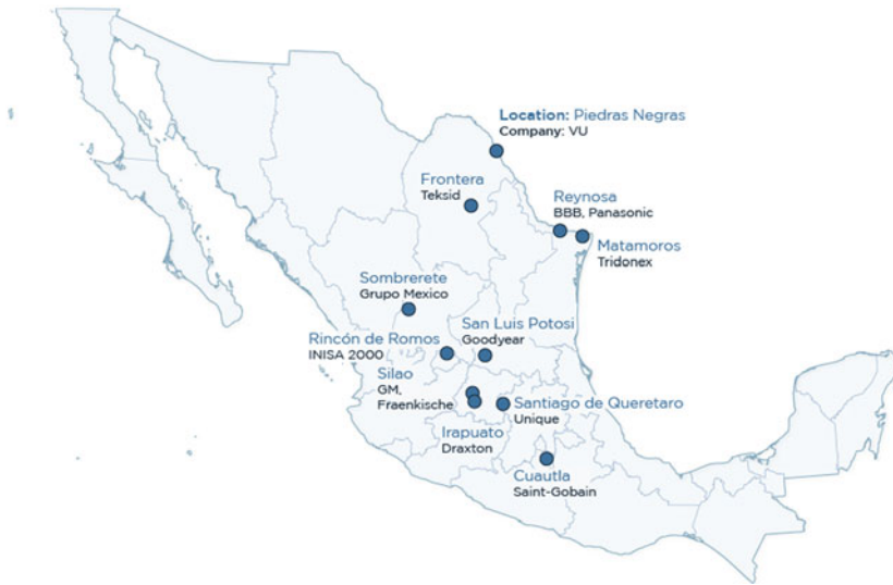
Figure 2. Most US Rapid Response Labor Mechanism situations have targeted Mexico’s automobile supply chain Note: With the exception of INISA 2000 (textiles) and Grupo México (mining), all facilities are in the automobile sector.

seeking new representation: After winning the vote, the new union negotiated a collective bargaining agreement in May 2022 that included an 8.5% wage increase the first year. Less than a year later, it negotiated another 10% wage increase. (The inflation rate in Mexico was 7.4% in 2021 and 7.8% in 2022.)