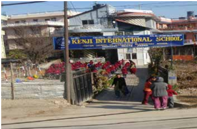
Image 6: Kenji International School

been very difficult. Yeah, closing the school was a bitter, but ultimately good, experience. It was the right decision.