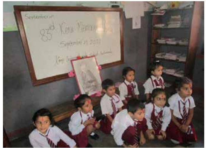
Image 9: Students of Kenji International School celebrating the anniversary of Miyazawa Kenji's birth