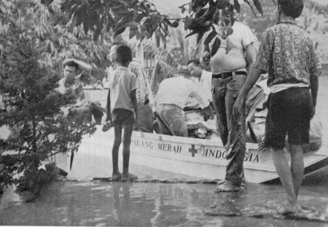
The Indonesian Red Cross in action to help the Djakarta flood victims in February 1970.