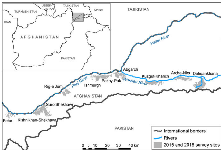
FIG. 1 Location of urial Ovis vignei and Siberian ibex Capra sibirica survey sites in the Hindu Kush mountains of Wakhan National Park, Afghanistan, in 2015 and 2018.

Pamirs and Hindu Kush ranges, with altitudes of c. 2,510–7,490 m (Smallwood & Shank, 2019). The Hindu Kush is dominated by high, steep peaks and associated glaciers, with less steep slopes and alluvial fans in the northern part of the range. Our surveys covered parts of the northern drainages of the Hindu Kush range, with heavy snow cover and glaciers deep inside the drainages limiting access and thus constituting the boundary of the study area to the south. The Hindu Kush mountain range in Wakhan shares an international border with Pakistan to the south. The Wakhan and Pamir Rivers comprise the upper courses of the Panj River; the Wakhan River separates the Hindu Kush from the Pamir mountain range in northern Wakhan, and the Pamir and Panj Rivers constitute the northern international border with Tajikistan (Fig. 1).