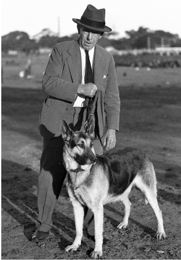
Figure 1. This ties to the transnational circulation and experimentation with the utility of this dog breed. “Male owner with German police dog,” July 1934, Mitchell Library, State Library of New South Wales, 42307.

Just as abolitionists used imagery of interspecies violence to mount a transnational campaign against chattel slavery, civil rights protestors in the United States and anti-colonial activists throughout Africa similarly revealed how interspecies violence defined each groups’ relationship to state power and to animals. 14