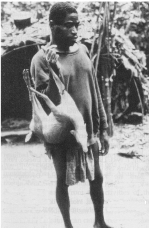
Blue duiker taken by subsistence hunting.

First, institutional self-sufficiency so that government organizations, NGOs and university research centres are effectively designing, funding