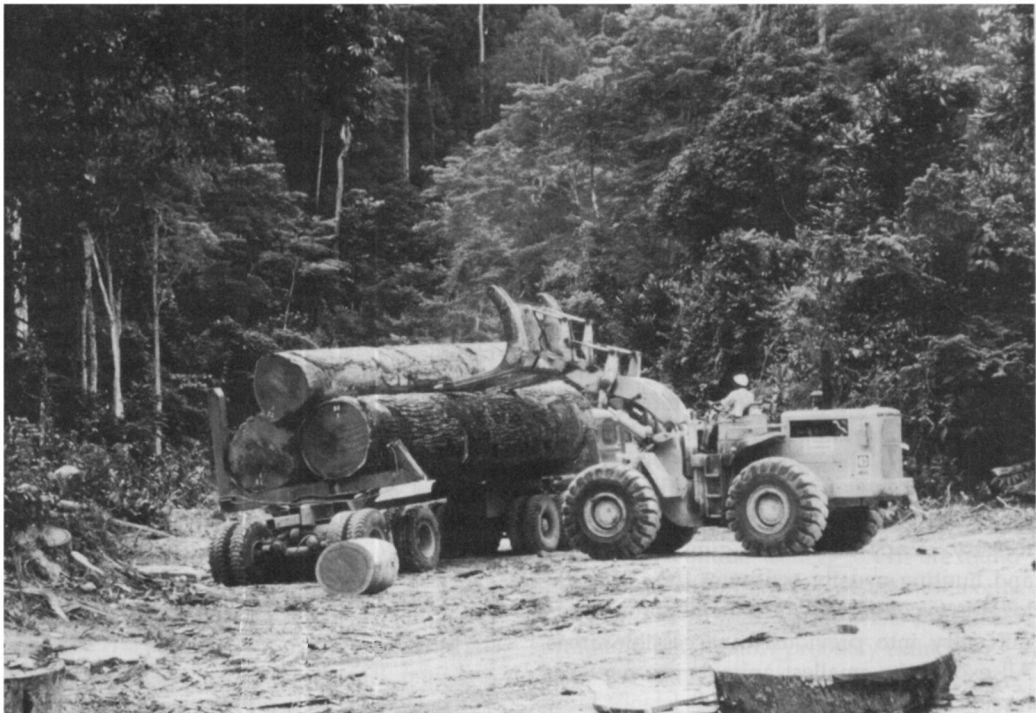
Logging in the Lopé Reserve (E. McShane-Caluzi).

The Gabonese Government has recognized the necessity for a forest management strategy