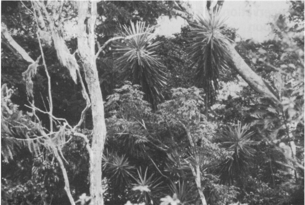
Elfin thicket covering the crests of the Belinga Mountains in north-east Gabon (C. E. G. Tutin and M. Fernandez).

per annum, with high humidity throughout the year. The region has a very distinct flora with a high number of endemics. Most notable is the okoumé Aucoumea klaineana , a West African endemic, which is the dominant species and a preferred timber tree for veneer and plywood. Gabon accounts for about 90 per cent of the world's market in okoumé. The coastal area is interspersed with numerous lagoons, rivers and mangroves. Threatened fauna include the manatee Trichechus senegalensis and leatherback turtle Dermochelys coriacea . This zone is probably the only place remaining in Africa where the western lowland gorilla Gorilla g. gorilla and forest elephant Loxodonta a. cyclotis can be found on Atlantic Ocean beaches.