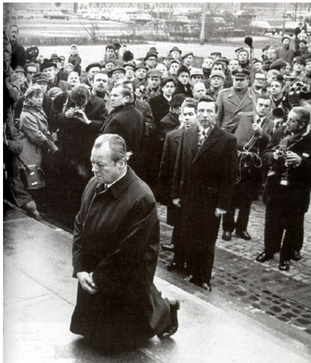
Willy Brandt at Warsaw, 1970

Comparison of the Japanese and German cases thus raises a puzzle. Japan's modest efforts to offer contrition repeatedly triggered sharp outcry among conservatives, who justified and even denied past atrocities. Because of backlash, Japanese contrition ended up alarming Japan's neighbors. In Germany, by contrast, far more ambitious efforts at contrition did not provoke a similar backlash. Though some West German conservatives preferred to emphasize a more positive national history, they did not deny or glorify Nazi crimes. The French thus viewed West German debates about the past as healthy, cathartic experiences for the country's democratic development—and as a reassuring signal about its intentions.