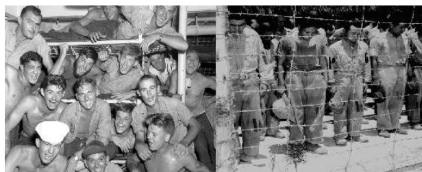
How will their countries remember them? How will their adversaries remember them? Left, American GIs celebrating Japan’s surrender, 1945; Right, Japanese POWs in Guam

Why might apologies matter in international politics—that is, why are they not merely dismissed as “cheap talk”? Apologies—or more broadly, national remembrance—matter because the way countries represent their pasts conveys information about foreign policy intentions. As countries remember, they define their heroes and villains, delineate the lines of acceptable foreign policy, and send signals about their future behavior.