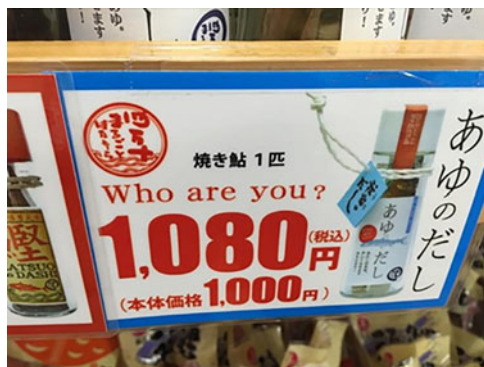
Figure 1. Who are you?

linguistic knowledge. Figure 2 displays a sign placed at a dentist's office with the text '歯 appy 歯 alloween', which is a hybrid phrase of Japanese script and the Roman alphabet. The kanji character 歯 in the text represents a tooth and is pronounced as 'ha' in Japanese. Thus, the text reads as 'ha-appy ha-alloween' to individuals who understand both kanji and English. The individuals who can fully comprehend this wordplay are those who possess graphic and phonetic knowledge of kanji , which enables them to recognise the character 歯 and its pronunciation. Moreover, comprehending this wordplay requires bridging the linguistic and cultural aspects of both Japanese and English. Contextual information, such as the location and timing of the text