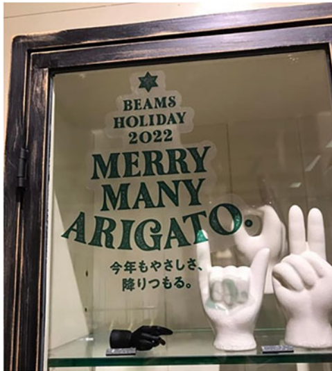
Figure 3. MERRY MANY ARIGATO

similar, adding an interesting phonetic effect when read together.