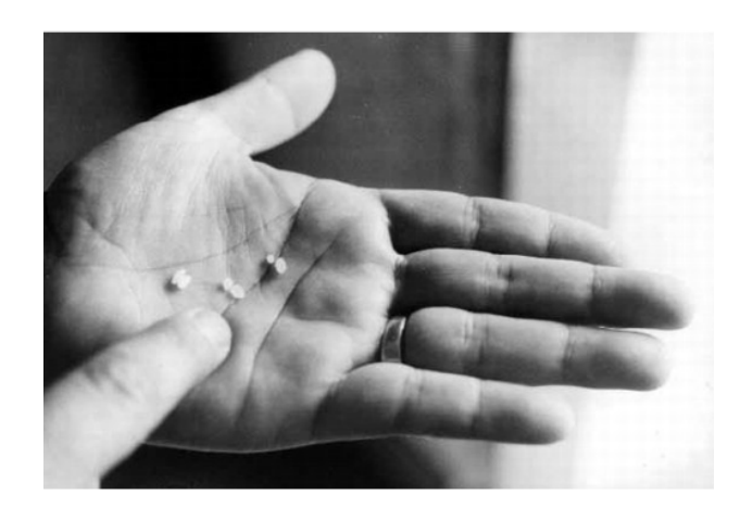
Rice-grain divination, popular in North Korea

One notable outcome of the precarious marketization of North Korean socioeconomic life, however, has not received the attention that it deserves. This is the return of a genre of traditional popular religion—in particular, the explosive growth of fortune-telling (sinjom) and related cultural practices in citizens' everyday lives since the late 1990s and especially since the early 2000s. Nominally an outlawed practice and punished (sometimes severely) if discovered, fortune-telling is, nevertheless, a familiar aspect of everyday life decision-making and life-cycle rituals in today's North Korea. Information on this phenomenon is limited as religion and religious culture continue to be a strictly guarded and sanctioned subject; hence, this report is nothing more than a preliminary inquiry into North Korea's popular religiosity based on scattered and fragmentary evidence.