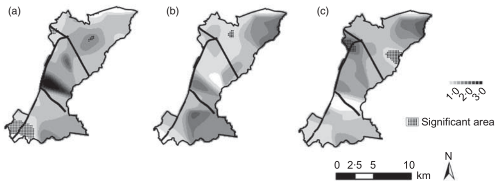
Fig. 3 Adjusted spatial analysis of the risk for metabolic complications, Campinas, São Paulo, Brazil, 2006–2007: (a) increased; (b) high; (c) very high

environment on the risk for type 2 diabetes, hypertension and CVD. The results presented indicate that the association of house location and RMC calls for more consideration. These population-based data for an urban region of 277 000 inhabitants and area of 128 km 2 showed few significant associations considering both crude and adjusted spatial risk. Age >30 years was associated with RMC in all three of its categories, while more years of study was protective for RMC only in the high risk category. Higher prevalence of overweight and obesity with increasing age and lower education levels has also been detected in Brazil by Monteiro et al. (7) .