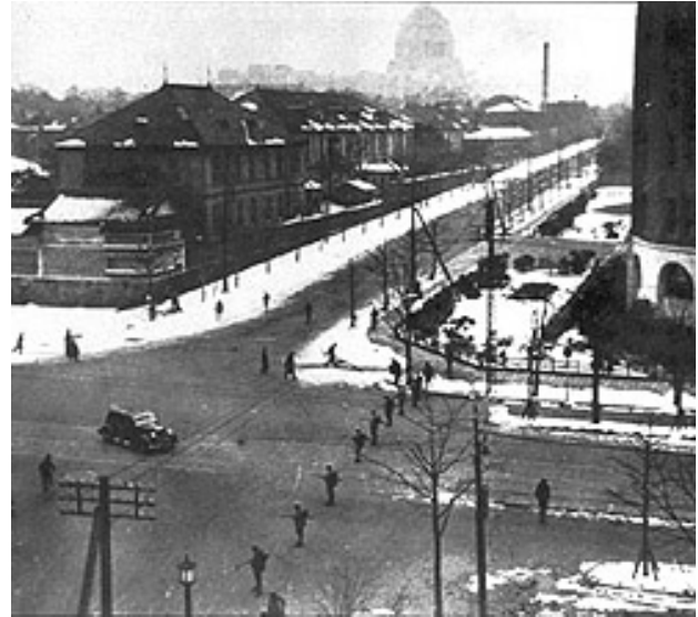
Japan's foreign ministry surrounded by military mutineers in 1936

Reacting against this "sleaze," the military led attempted coups on May 15, 1932 and on February 26, 1936.