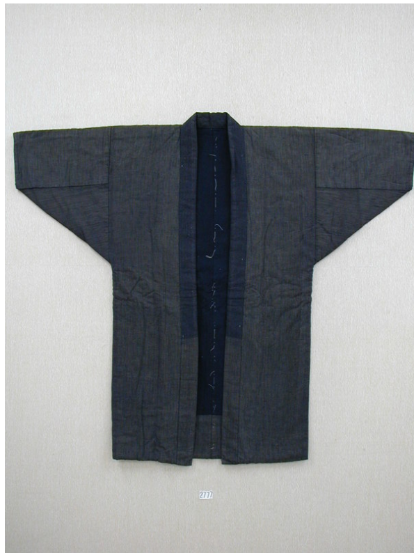
A men's hanten jacket, similar to the one in the text, Kitakyūshū Museum of Natural History and Human History

I learned that the old lady had been born in Meiji 32 (1899), in a small mountain village right around the border of Nagasaki and Saga Prefectures. There were about 30 families living there, all of them very poor. As villagers commonly did back then, they cultivated tiny pieces of land up in the hills, and to augment their livelihood, some would come down in summer to do odd jobs in town, or they would supplement their income in winter by making charcoal. Simply by being the first-born daughter, her fate had been sealed, since it fell to the first-born child to bear the brunt of the household duties. There was no questioning this, and one was not able to refuse. That was just the way things were up to the 1940s or so. Sisters and brothers followed in due course, but then, when she was 10, her mother died because she had gone back to work too soon