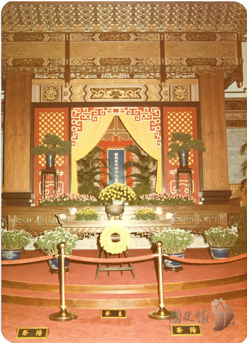
Figure 6. The spirit tablet of all who died for the National Revolution inside the Great Hall of the Martyrs' Shrine. Source: Academia Historica, President Hsieh Tung-min (1908–2001) Archives, AH 009-030205-00013-010. Date: 29 March 1983.

Initially, in this space dedicated to memorializing the patriarchal lineage of the nation, the first lady had no duties at the shrine and was not included in any ceremony. The wives of visiting foreign dignitaries appear to have been