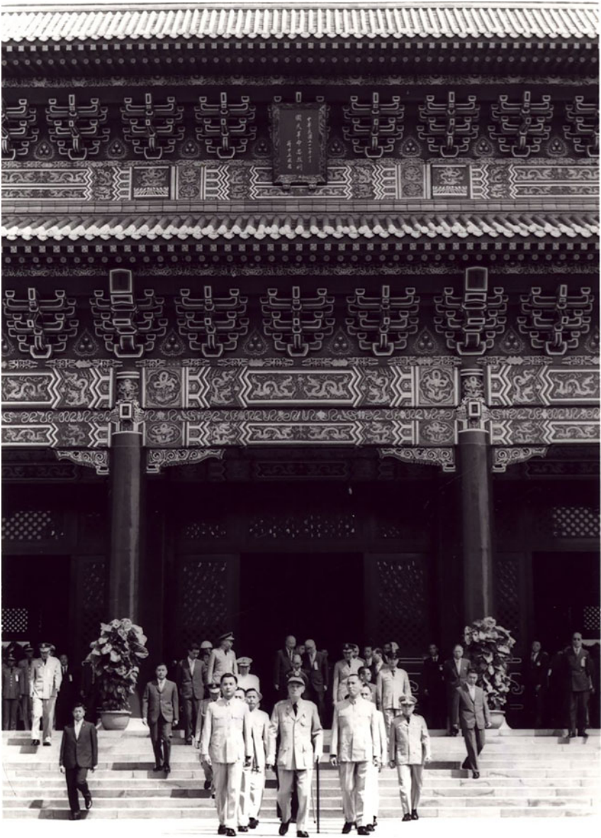
Figure 5. Chiang Kai-shek and senior officials at the Martyrs' Shrine performing the autumn sacrifice for the national martyrs. Date: 1971.

beasts. Plum blossoms, associated with the ephemerality of youth and beauty, as they bloom splendidly and fade quickly, are also used as a decorative motif on the shrine roof. As in many traditional temples, the main gate is flanked by a pair of male and female lions to protect the shrine from spiritual harm.