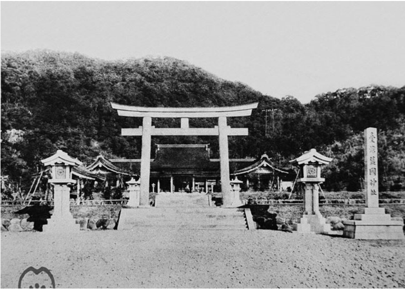
Figure 1. A photograph of the Taiwan National Protection Shrine. Source: Taiwan National Protection Shrine Construction Committee, Zhenzuo jinian Taiwan huguo shenshe (The township celebrates at Taiwan National Protection Shrine). National Museum of Taiwan History. Date: 1942–1944.

grafted itself onto the remnants of the Japanese occupation era, replacing Japan as the new legitimate power. 46