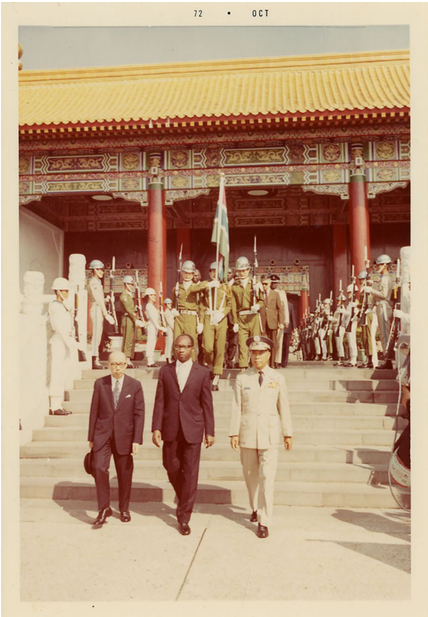
Figure 7. Vice-president Yen Chia-kan accompanying the first president of the Gambia Dawda Jawara to offer flowers to the martyrs at the National Revolutionary Martyrs' Shrine. Date: 1972.