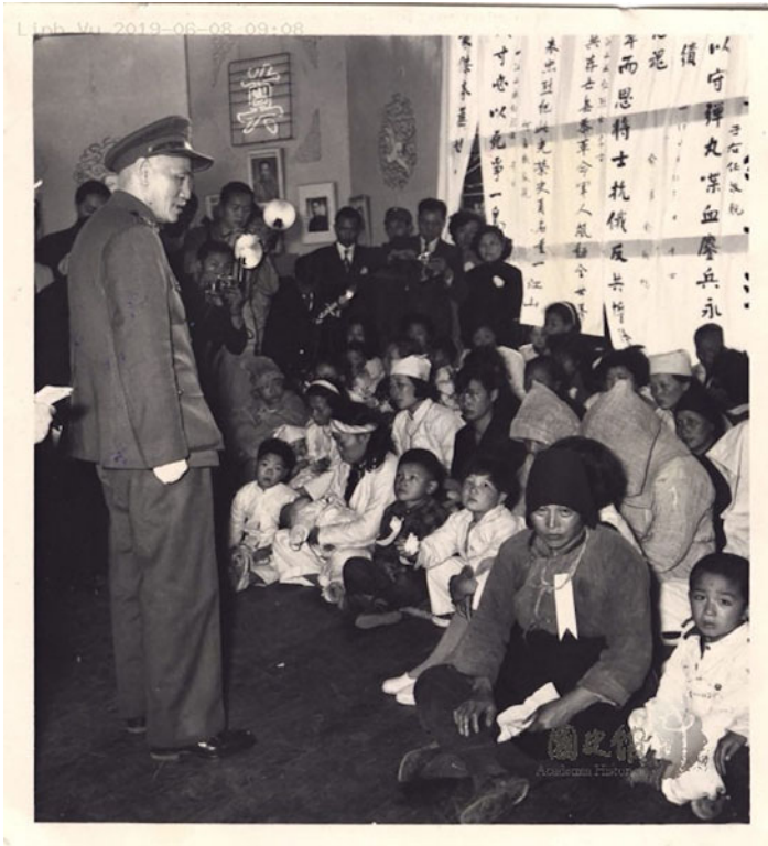
Figure 4. Chiang Kai-shek personally consoling relatives of the Yijiangshan Islands martyrs during the memorial service. Date: 1955.

400,000 martyrs, individually and collectively. The Ministry of Defence managed the shrine. The Nationalist Party's Central Executive Committee approved how the shrine 'expresses the national characters of solemnity and grandeur' ( biaoxian zhuangyan hongwei zhi minzu texing ). 58 The inaugural ceremony in March 1969 included over 2,000 participants. The minister of the interior officiated at the civilian martyrs' wing with the assistance of the head of the Five Yuans. The minister of defence officiated for the military martyrs with the assistance of the chief of staff and the commander-in-chief of five branches of the armed forces. Representatives from government offices and the Nationalist Party, students, and martyrs' children also attended the ceremony. 59