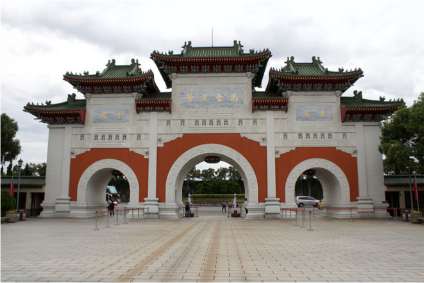
Figure 9. The Gate of the Taipei National Revolutionary Martyrs' Shrine. Date: 10 June 2019.

In fact, even though the end of martial law in 1987 terminated the authoritarian rule of the Nationalist Party in Taiwan, the Martyrs' Shrine continued its ritual function under the first Taiwan-born president, Lee Teng-hui (1923–2020), and under the first Democratic Progressive Party (DPP, Minjin dang ) candidate to win the presidential election, Chen Shui-bian. The latter challenged many legacies of the Nationalist Party, for example, by renaming Chiang Kai-shek Memorial Square into Liberty Square in 2007 and removing hundreds of Chiang's statues from public areas. Despite Chen's effort to de-Sinicize and 'de-Chiang-ify' ( qu Jiang hua ) the island, he reportedly conducted the spring and autumn sacrifices at the shrine as prescribed by the previous leadership. 81 Although the Martyrs' Shrine and its commemorative ceremonies were a Nationalist Party creation, they were embraced by the DPP leadership, albeit ambivalently. The shrine has become a national symbol that, to some extent, transcends contentious party politics.