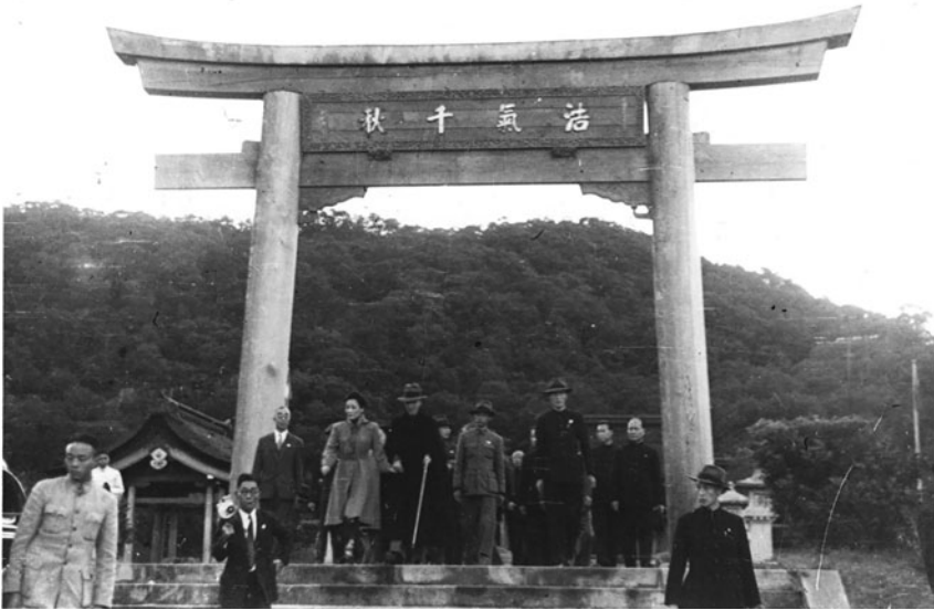
Figure 2. Chiang Kai-shek, his wife Soong Mei-ling, and Nationalist high-ranking officials at the Yuanshan Loyal Martyrs' Shrine holding a memorial service for fallen officers and soldiers. Date: 1946.

Remembrance and Spring Sacrifice for Fallen Officers and Soldiers' ( Geming xianlie jinian ji chunji zhenwang jiangshi dianli ) (see Figure 3 ).