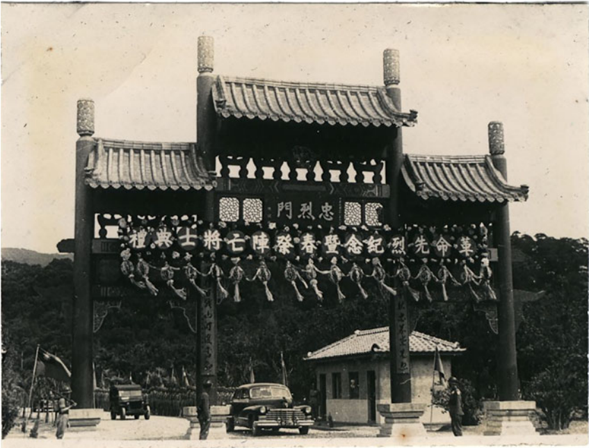
Figure 3. The Yuanshan Loyal Martyrs' Shrine during the spring sacrifice for national martyrs. Date: 29 March 1950.

the president, assisted by the head of the Five Yuans (the Executive, Legislative, Judicial, Examination, and Control branches of the government), presided over the ceremony. The spring sacrifice was set for 29 March, the anniversary of the Yellow Flower Hill uprising (also chosen as Youth Day), and the autumn sacrifice for 3 September, the anniversary of the end of the Second World War (also chosen as Armed Forces Day). The ceremony began at ten o'clock and lasted half an hour, during which time participants played music, presented flowers, read elegies, and made three bows. During the ceremony, the martyrs' spirits were conjured up to 'partake in the offerings' ( shang xiang ). 50 Each year, Presidential Office staff drafted a new elegy with content that emphasized the transcendental nature of martyrdom. For instance, the elegy drafted for the president to recite in 1950 underlined how the honour of martyrdom meant an immortal afterlife: 'the ordinary people become nothing when they die; only the loyal and the self-sacrificing ones do not when they pass' ( Heng ren zhi si, jie gui wu wu, wei zhong yu lie, sui yun er bu ). 51 In the 1950s and early 1960s, only the revolutionary predecessors and fallen officers and soldiers could enjoy the sacrifices. The 1967 elegy read during the spring sacrifice included the 'martyred kindred' ( sinan tongbao ). 52 In