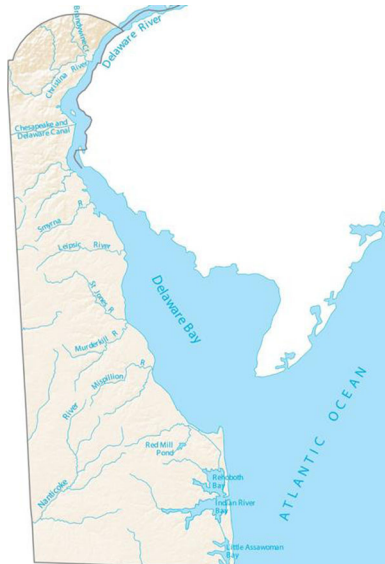
Figure 2. Major rivers in Delaware.

including ponds, rivers, and streams. The better-known ponds include Becks, Lums, and Trap Ponds. Sheerness Pond in the center of the state is the largest at 250 acres. Figure 2 is a map of the major rivers.