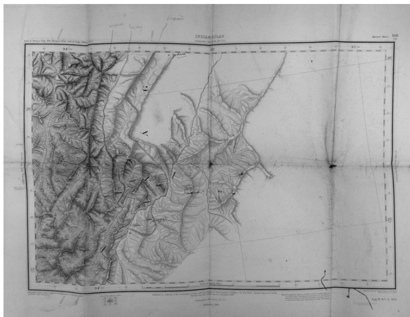
Figure 1.1 Indian Atlas, sheet 130 S.E. (eastern Naga Hills), with three lines later added showing (from left to right) ‘Original’, ‘Existing’, and ‘Proposed’ boundaries (1904). 76